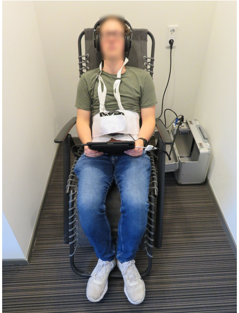
Fig 2. The equipment used for both the HALF-MIS treatment and the higher frequency variant in a clinical setting. Reprinted from T.A.H. Eshuis et al. under a CC BY license, with permission from T.A.H. Eshuis et al., original copyright [2021].

https://doi.org/10.1371/journal.pone.0259394.g002