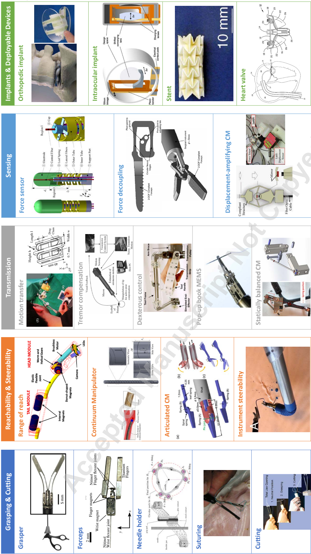
Fig. 2. An overview of different surgical applications of compliant mechanisms (CMs). Images: Grasper; Forceps; Needle holder; Suture; Cutting; Range of reach; Continuum Manipulator; Articulated CM; Tremor compensation; Dexterous control; Pop-up book MEMS; Statically balanced CM; Displacement-amplifying CM; Force decoupling; Displacement-amplifying CM; Orthopedic implant; Intraocular implant; Stent; Heart valve.