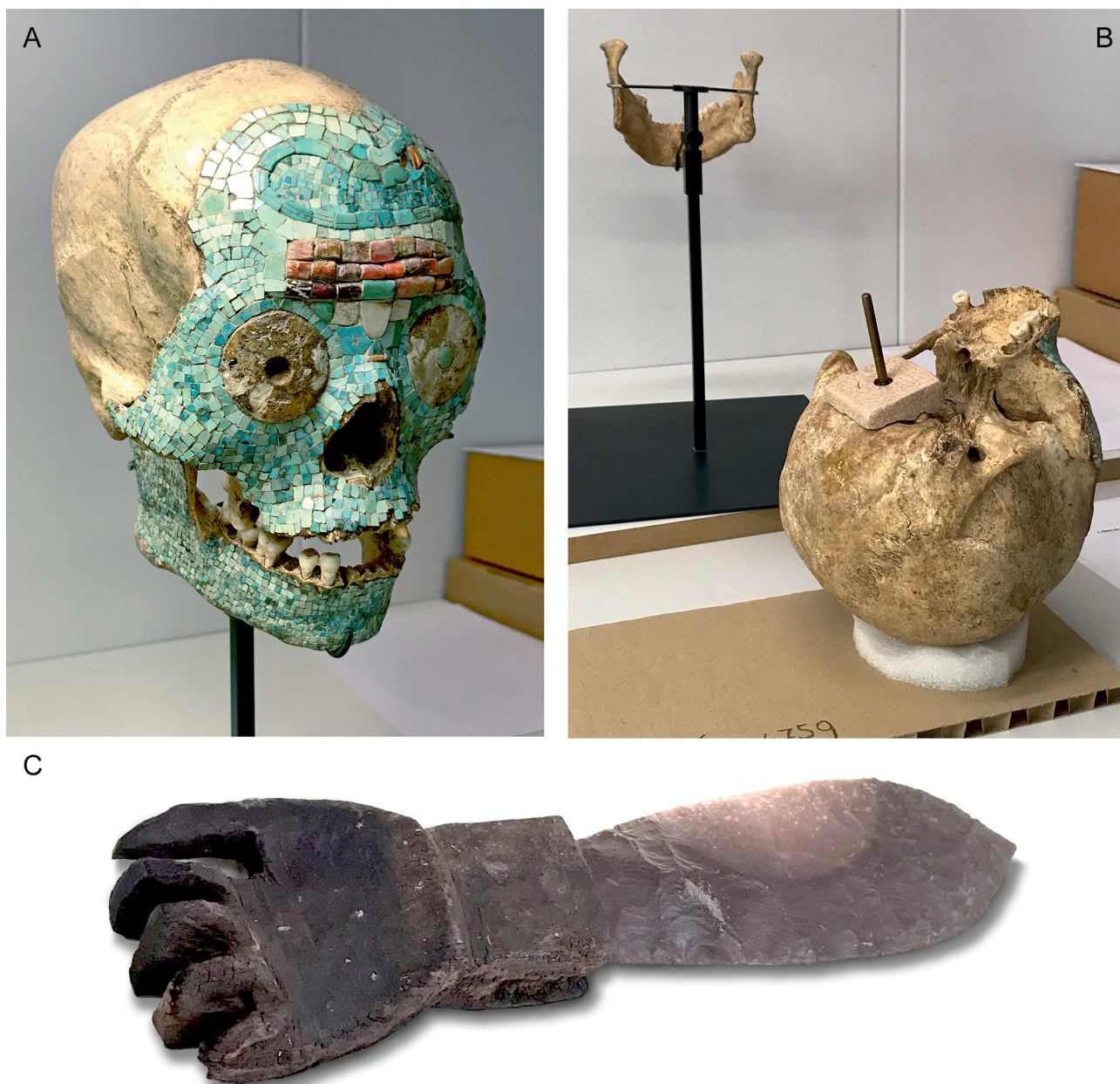
Fig. 1. a. The decorated skull ready to be sampled. b. Before sampling, the stand was removed and thin bone parts were taken from the inside of the skull. c. The ceremonial knife ready to be sampled (Collection Nationaal Museum van Wereldculturen, Coll.Nos RV-4007-1, RV-3928-2. Photo P. Erdil).

display purposes. Dust-like, wooden fibres were clipped out from the wooden handle of the ceremonial knife. The sample preparation protocols used in this study are covered in the following sections and more information can be found in Dee et al. (2020).