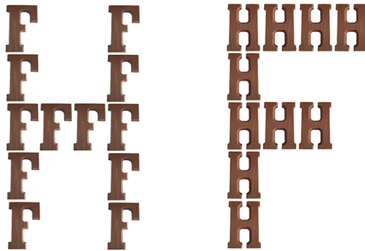
FIGURE 1 | Sample pictures of “chocolate” Navon letters (Study 2). Left: sample stimulus used in the global condition; right: sample stimulus used in the local condition.

0.98) and other sweets ( M = 3.78 , SD = 0.99 ; \alpha = 0.91 ). Note that we chose for only two desire to eat items to avoid overtaxing participants (as they had to evaluate a total of sixteen sweets). The study ended with debriefing participants about the aim and structure of the study.