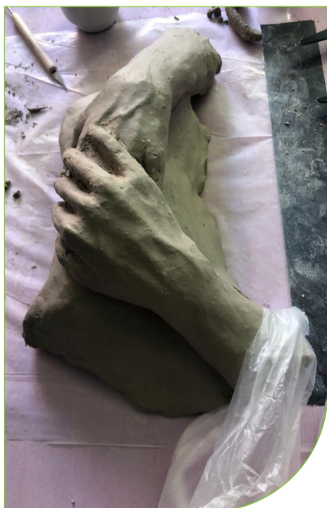
FIG.3 SCULPTING, WORK PERIOD S03E02

Rizzo responds to clay, a sculptural material of high plasticity that is ubiquitous, affordable, and durable, provided it is fired. Rizzo's body is not only dancing/ corresponding with the clay, but he also uses sculpting tools to cut and carve the material. Ingold calls these tool transducers . In the animacy of dance they "convert the gesture, flow or movement" of Rizzo "from one register, of bodily kinaesthesia, to another, of material flux." 14 The pressure or soft touch of the cutting and carving by Rizzo is converted from his body to the material. Sitting across the table from him while he is sculpting folded or praying hands, I can witness the correspondence between him, the clay, and the sculpting tools. He tells me that his practice of sculpting clay (especially figurative sculpting) coincides with his ability of creating movements: "While dancing I have learned to master a specific attitude which also guides me while I am sculpting: a sensible dialectic relationship between movement and material based on a symbiosis between the knowledge of the human body and proprioception (the feeling of my own body, position of my body)." Observing the choreographer as sculptor, I notice how he takes his own hands as reference point, looking back and forth between the molded hands and his moving sculpting hands, comparing them with each other. Sometimes he stops to lay his hands next to the sculpted counterpart.