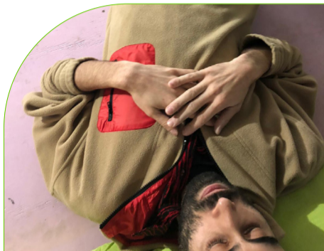
FIG.4 MODELLING, WORK PERIOD S03E02