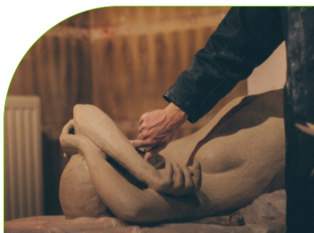
FIG.5 SCULPTING, WORK PERIOD S03E02