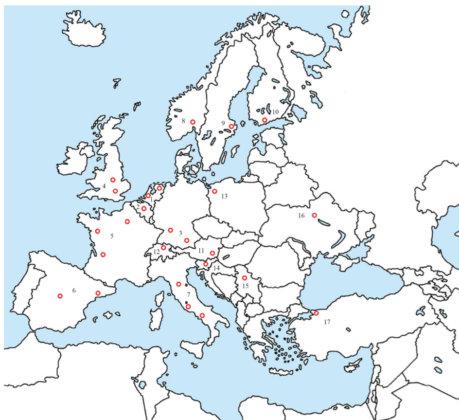
Fig. 2 Geographical dispersion across Europe of responding bone sarcoma centres. 1. Netherlands: University Medical Center Groningen, Leiden University Medical Center. 2. Belgium: Jules Bordet Institute Brussels. 3. Germany: Medical Center of the University of Munich, Stuttgart Cancer Center Olgahospital. 4. United Kingdom: University College Hospital London, Royal Orthopedic Hospital Birmingham. 5. France: Limoges Teaching Hospital, University Hospital Hotel-Dieu Nantes, Hospital Cochin Paris. 6. Spain: Hospital Universitario de Bellvitge Barcelona, Hospital Universitario La Paz Madrid. 7. Italy: Centro Traumatologico Ortopedico Florence, Regina Elena National Cancer Institute Rome, Cancer Institute G. Pascal Foundation Naples. 8. Norway: Oslo University Hospital. 9. Sweden: Karolinska Hospital Stockholm. 10. Finland: Helsinki University Central Hospital. 11. Austria: Medical University of Graz. 12. Switzerland: Balgrist University Hospital Zürich. 13. Poland: Pomeranian Medical University of Szczecin. 14. Slovenia: Ljubljana University Medical Centre. 15. Serbia: Institute for Oncology and Radiology Belgrade. 16. Ukraine: National Cancer Institute Kiev. 17. Turkey: Acibadem Maslak Hospital Istanbul.