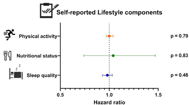
Fig. 1. Univariate logistic regression of self-reported lifestyle components and incident AF.

Numbers are represented as counts (percentage), continuous variables as mean SD or median (interquartile range). P-values for continuous variables are calculated with Wilcoxon test and for categorical data with Fisher exact test. Abbreviations: AF = Atrial Fibrillation, SD = standard deviation.