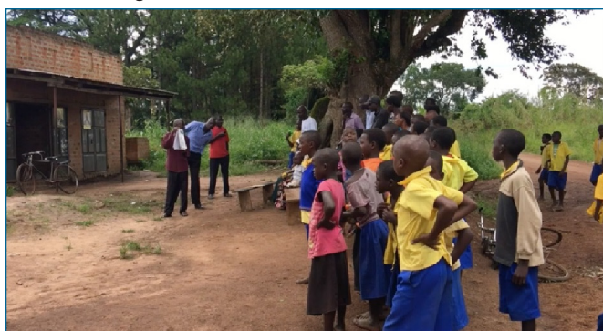
Figure 3: Village healthcare team using the flipchart to educate villagers

Quantitative evaluation was conducted with pre- and post-knowledge questionnaires developed during the project. After the first groups were run, we modified the questionnaires for better clarity and to remove non-discriminatory items. The results of the subsequent HCWs undergoing training showed general improvements where initial knowledge was suboptimal (Table 1). Their mean scores before training were 74% correct, and after, 89% were correct. As expected, some facts were already well-known, such as particulate matter and carbon monoxide are toxic products in biomass smoke. Other facts, such as that vaccinations are a component of lung health, were less well-known. Only two out of 36 questions showed no improvement