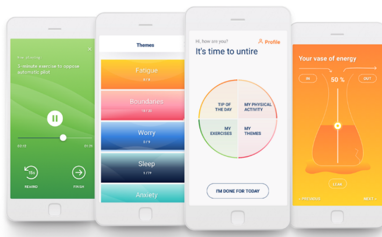
Figure 2. The Untire self-management app: (a) mindfulness-based stress reduction audio exercises, (b) psychoeducative themes, (c) the daily program, and (d) the vase of energy.

After opening the Untire app for the first time, participants received a short introduction on how to use the app. Participants were informed that every time they revisit the app (ie, reopen the app), a (new) daily program will be presented. The daily program consists of the 4 following core components: (1) My themes , (2) My exercises , (3) Tip of the day , and (4) My physical activity ( Figure 2 ). Participants also received information about the weekly assessments of their fatigue and related components, the so-called Quick scan . The Vase of Energy is an integral part of the Quick scan . Participants were also invited to think about informing a friend or family member, a so-called buddy , to help or motivate them to work with the app. All the modules are explained below in detail (also see Table 1 and Figure 2 ).