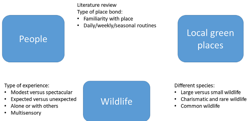
Figure 1. Interview themes.

We recruited participants of different sociodemographics, and from both rural (<6000 inhabitants) and urban places of residence (50 000 to 200 000 inhabitants) (see Table 1). These criteria were based on previous research which had demonstrated that wildlife experiences matter in the perceived attractiveness of local green places among a general Dutch public (Folmer et al., 2016). There were no preconditions regarding participants' relationship with wildlife.