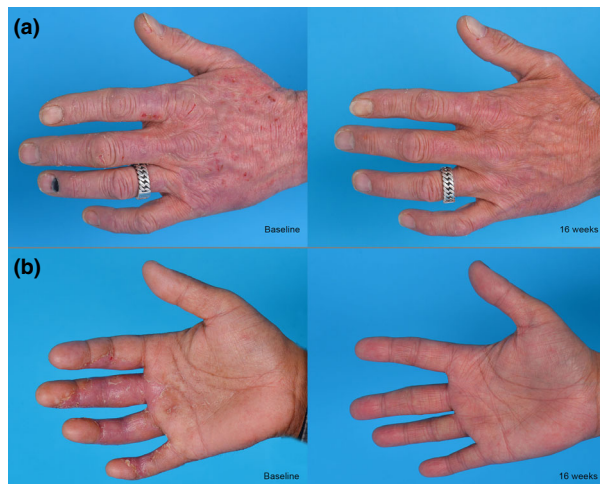
Figure 2. Clinical improvement of patients after 16 weeks of dupilumab treatment. (a) A patient with very severe chronic fissured hand eczema improving from a Hand Eczema Severity Index (HECSI) score of 129 to 9. (b) A patient with very severe recurrent vesicular hand eczema improving from a HECSI score of 168 to 4.