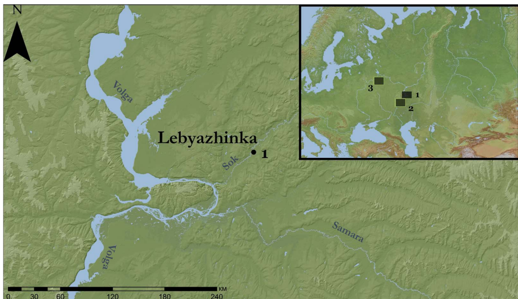
Figure 1 Map of European Russia: (1) the Lebyazhinka site; (2) Khvalynsk I and II site; and (3) Shagara site.

This grave contained the remains of five skeletons. We assume, according to the stratigraphy and planigraphy of the grave that all humans were buried simultaneously. The Late Bronze Age