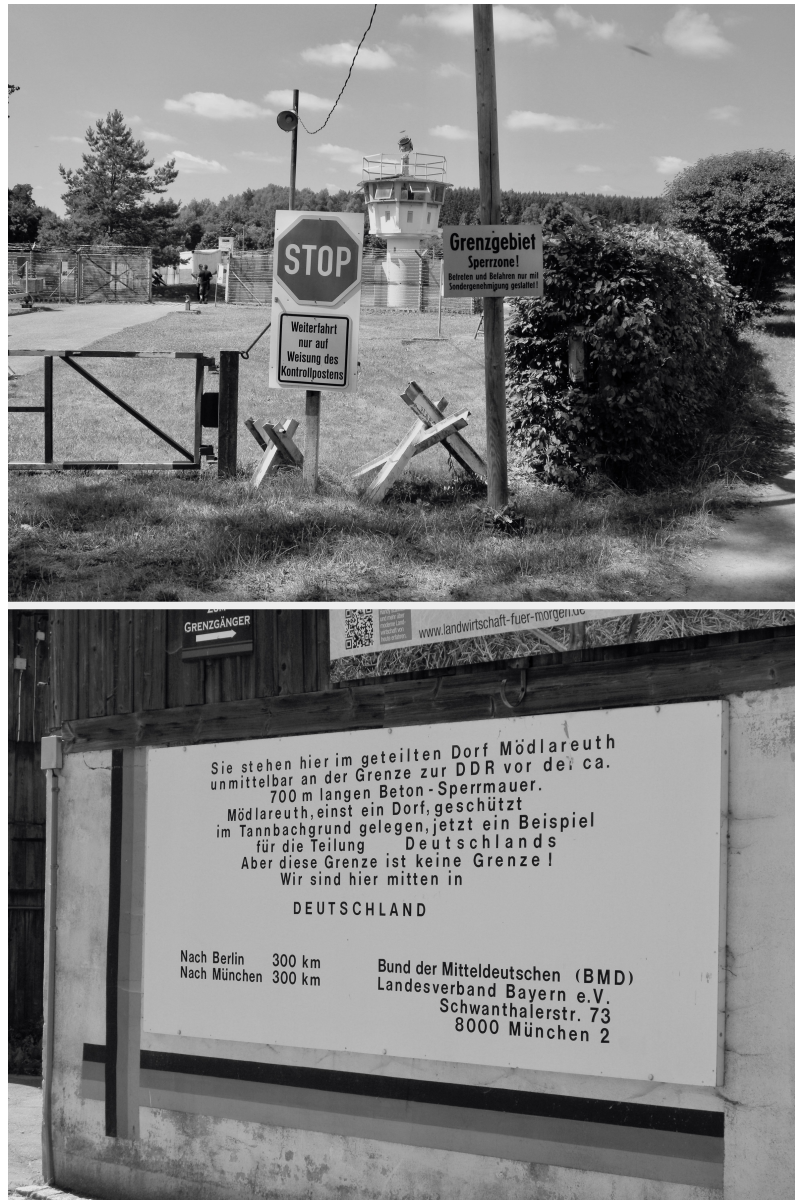
Figure 2. Top: Impression of the German-German museum in Mödlareuth. Bottom: Information panel in Mödlareuth on the previous border wall, stating: “You are standing here in the divided village of Mödlareuth directly at the border to the GDR in front of the approximately 700-meter-long concrete barrier wall. Mödlareuth, originally one village and sheltered in the Tannbach area, is today an example of the division of Germany. But this border is not a border! We are here in the middle of Germany”.

https://www.researchgate.net/project/Borderless-worlds-for-whom-Ethics-moralities-and-mobilities-Routledge