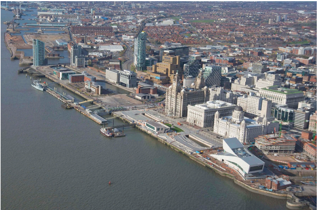
Figure 2. The Liverpool Waters development project: Before (Rust Studio 2016).