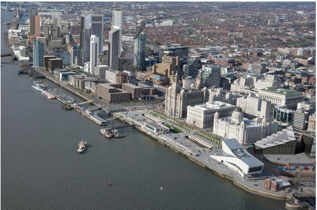
Figure 3. The Liverpool Waters development project: After (Rust Studio 2016).