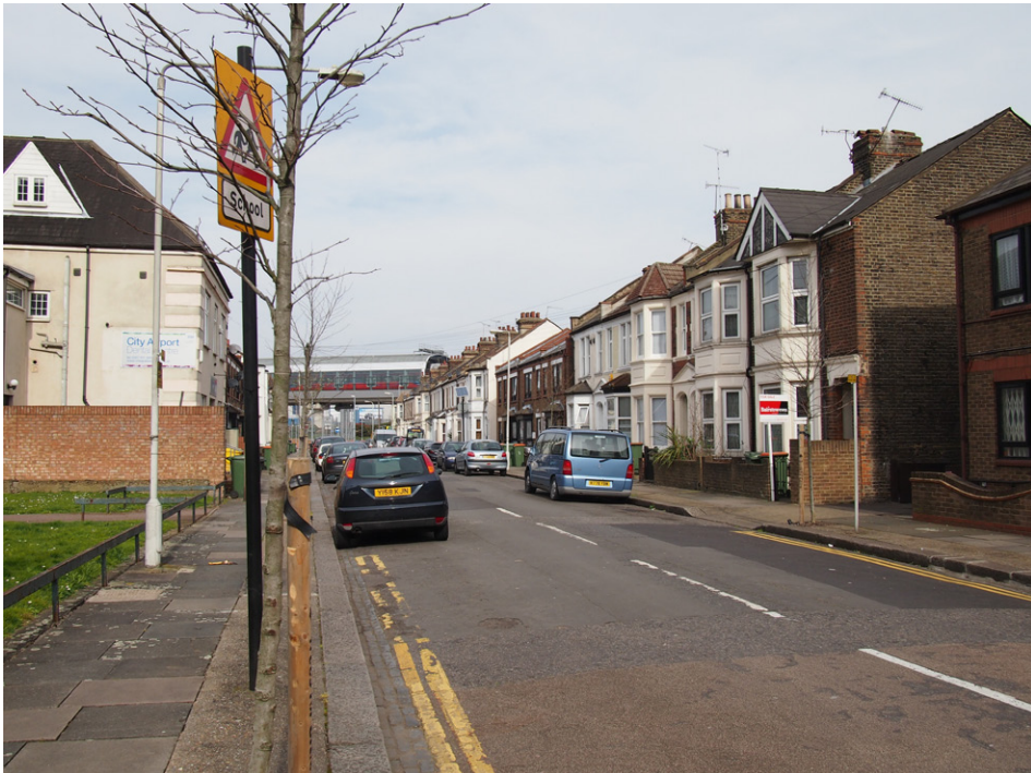
Figure 4.2: Existing houses in North Woolwich.

The architect considered the improved maintenance works of the tidal flood defences as the main reason: 'they're now maintaining them more often, and they've now put site risk as residual, which means it's a much better condition for being able to build things.' The Planning Advisor from the EA mentioned the urge for development as a reason: 'we don't insist on threshold levels being set above that depth because realistically that would just prohibit any development in that area by asking them to raise all buildings by seven meters'. Moreover, he stated that they insist upon an evacuation or refuge strategy, but that 'anything extra in terms of building resilience is a bonus really'.