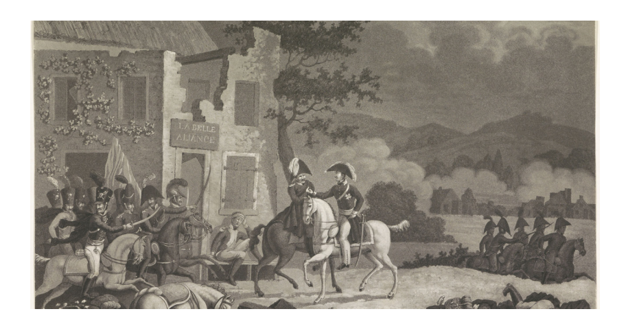
Meeting between Wellington and Blücher after the Battle of Waterloo, 1815. Illustrator: Willem Hendrik Hoogkamer. Collection Rijksmuseum Amsterdam, number RP-P-OB-87.190