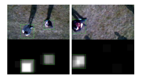
Fig. 1: Images as shown in detector mode. The original image is on top while the 2D histogram is on the bottom. The bounding boxes indicate where the detector has found positives after applying a threshold.