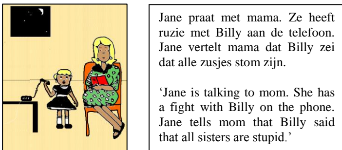
Figure 1: Sample elicitation item in production task, see protocol in (5)

what the second person said about the first person (targeting a double embedding: “ The sister said that Billy said that ... ”). Note that the natural way of answering these questions is to start with a complementizer, thus dropping the main clause subject and verb, which was in fact what most participants did. The task targeted six single-embedded clauses, (5a), and six double-embedded clauses, (5b), making a total of 12 stories.