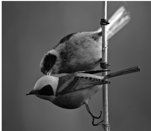
Fig. 1. Resident male penduline tits react to playback song and a dummy penduline tit around their nest. Behavioural responses included attacking, i.e. pecking at the dummy, as seen on this photo.

By repertoire size we refer to syllable repertoire size, i.e. the total number of different syllable types sang during various song bouts (KROODSMA 1982). Since Eurasian penduline tits have small repertoires (range 11–20 in our population, see sonograms of some of the