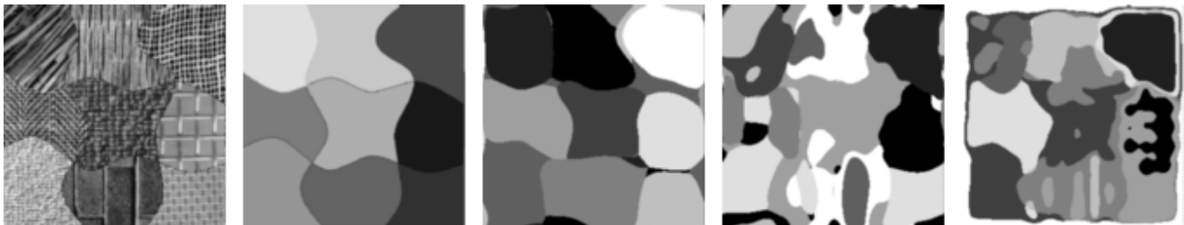
Figure 3. Results of segmentation experiments using the K-means clustering algorithm. The left-most image shows an input image containing nine different textures. The exact segmentation of the input image is shown in the second image from the left. The three right-most images show the segmentation results based on the grating cell operator features (middle column), the Gabor-energy features (second column from the right) and the cooccurrence matrix features (right-most column).