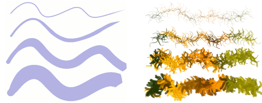
Figure 3: Strokes can be sketched with pen, one finger, two fingers, fist (left side). Strokes are rendered to texture and distributed with the one finger posture (shown on the right side) or the fist posture (this would produce more strokes within a larger region). The different colors of the strokes on the left side are derived from the underlying color image.