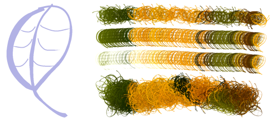
Figure 4: A sketched stroke (left) is first distributed with one finger, aligned with two fingers, faded with the hand, and redistributed with the fist posture (right, from top to bottom).

mapped to stroke alignment which can be used to organize strokes once they have been applied, for instance to emphasize certain structures in the image. While automatic alignments could certainly be derived, e. g., from image edges or gradients [Her03], our interactive alignment allows exploration of stroke alignment, providing more flexibly and creative freedom. Predominantly linear features can easily be created by sketching a stroke in alignment direction, distributing it on the canvas, and finally using the alignment posture. Here the two fingers of the posture serve as a natural indication of the alignment direction.