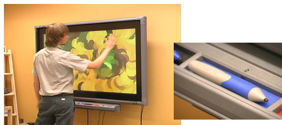
Figure 1: Hand postures in use and a pen as physical prop.

We extend the Interactive Canvas [SIMC07] that supports the creation of stroke-based renderings (SBR, [Her03]). The previous system only allowed indirect interaction through a set of widgets: a palette, tools, and a pre-defined set of primitives. During informal observations of the system's use, we discovered that this type of interaction was not sufficient to allow people to express their creative ideas. Several people expressed, in particular, the desire to create their own strokes in order to have more creative freedom. One person mentioned, e. g., that it is "hard to find a good cloud texture." When more formally studying [GHC*07] an adapted system with an on-screen menu controlled by a separate Wii Nunchuck instead of the palette we gathered that participants