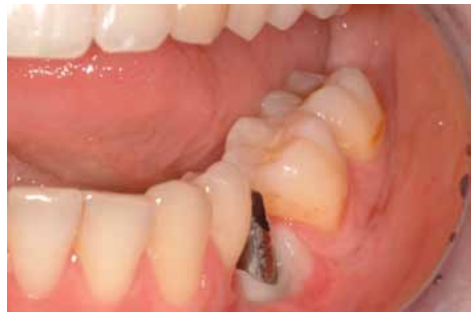
6 Titanium individualized abutment placed.

and the fixation screw. The screw used to fixate the bone graft was removed and the implant (Osseotite, Certain Preval; Biomet 3i), diameter 4.1 mm/length 8.5 mm, was placed using the template, according to the procedure advocated by the manufacturer. The shoulder of the implant was placed at bone level. A coded healing abutment (Encode; Biomet 3i) with a height of 4 mm was placed to develop an emergence profile. The surgical site was closed with sutures (Vicryl 3-0; Johnson & Johnson, Brunswick, NJ). After 2 weeks the sutures were removed.