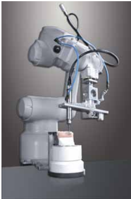
2 Device that drills hole in definitive cast and places implant analog. Device is connected to computer, which has information from coded healing abutment.