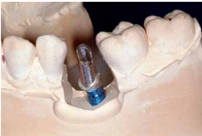
5 Individualized abutment seated on implant analog.