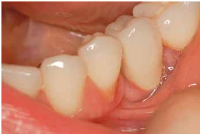
7 Restoration after service for 24 months.