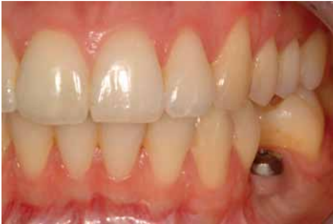
3 Buccal view of healing abutment.