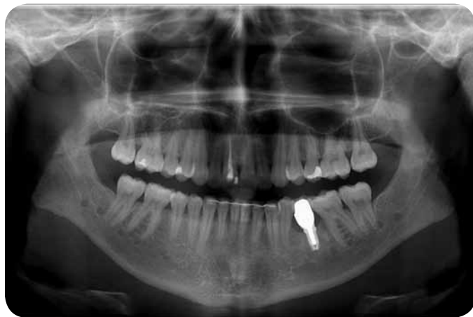
8 Panoramic radiograph of definitive result. Note horizontal bone loss due to congenitally missing mandibular left premolar. Implant was placed at bone level

the precise fit between the individualized abutment and the metal ceramic crown, only a minimal amount of cement was needed to place the crown. To date, the restoration has been in service for 24 months without complications (Fig. 7, 8).