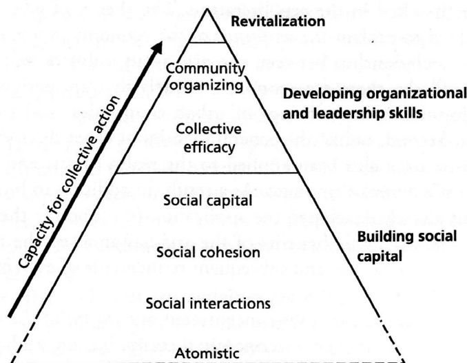
Figure 9.3. Model of the theory of community revitalization (reprinted from McCarthy et al., 2004, p. 87)

It seems that aesthetic experience can aid in the first stage of community development by promoting interaction amongst group members (attending the performing arts is, in itself, a social activity that links members of a group to one another – which is an extrinsic function of aesthetic experience), by representing personal and community identities (and thus strengthening them and instilling them in group members – which is an intrinsic functioning of aesthetic experience) and promoting social cohesion (through the strengthening of existing group identities or questioning of such identities). Bonding ties are created between community members both when their community’s identity is being represented and affirmed (when the experience becomes artistic) and when the community’s identity is being questioned. Bridging ties are created when the audiences (or participants) of cultural activity come from various backgrounds and present their community’s identity to one another or represent an altogether new but common identity. It seems that, in both these cases, the experience immediately becomes artistic in nature, for the experience forces one to question one’s identity.