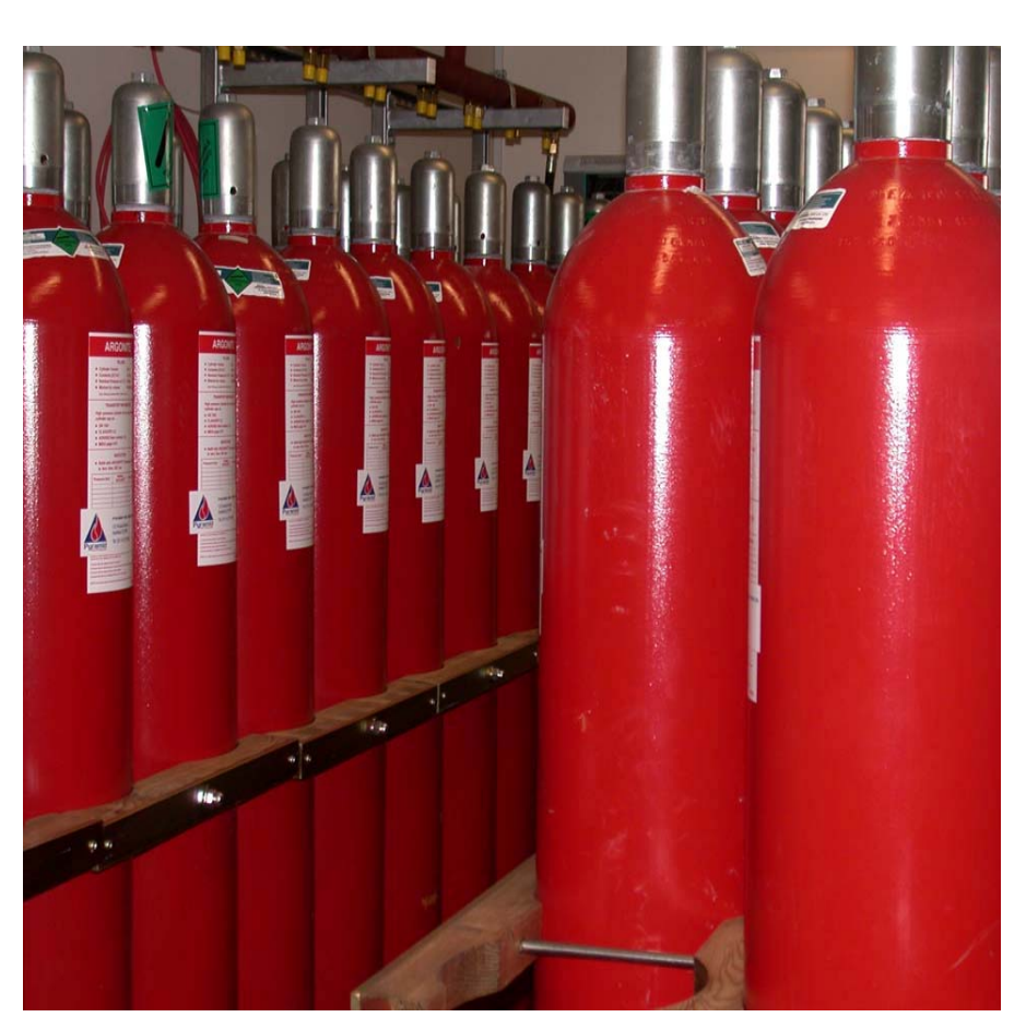
Fire suppression system, NGRC Keyworth

Information Management Programme Internal Report IR/11/009