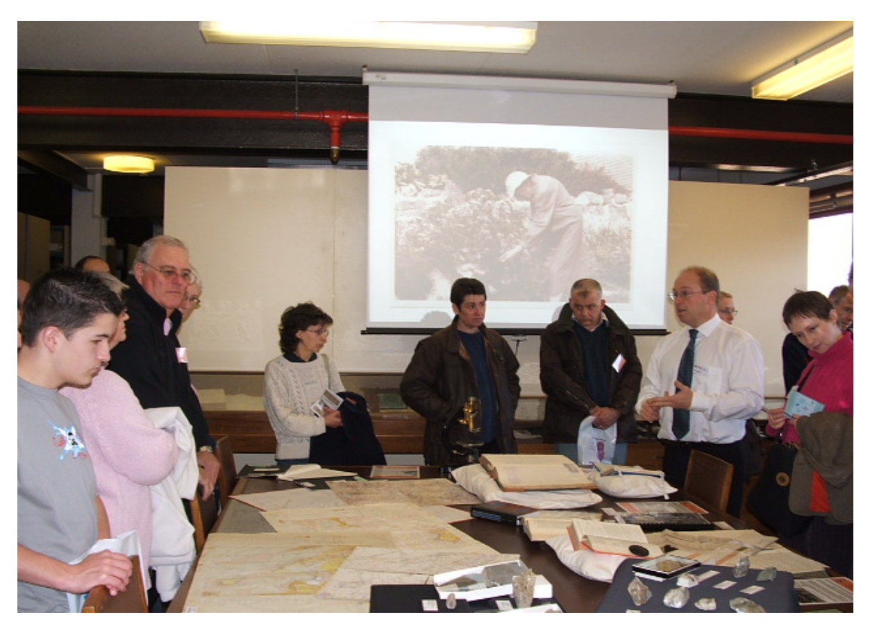
Archives Awareness Campaign 2007: Visitors to the NGRC