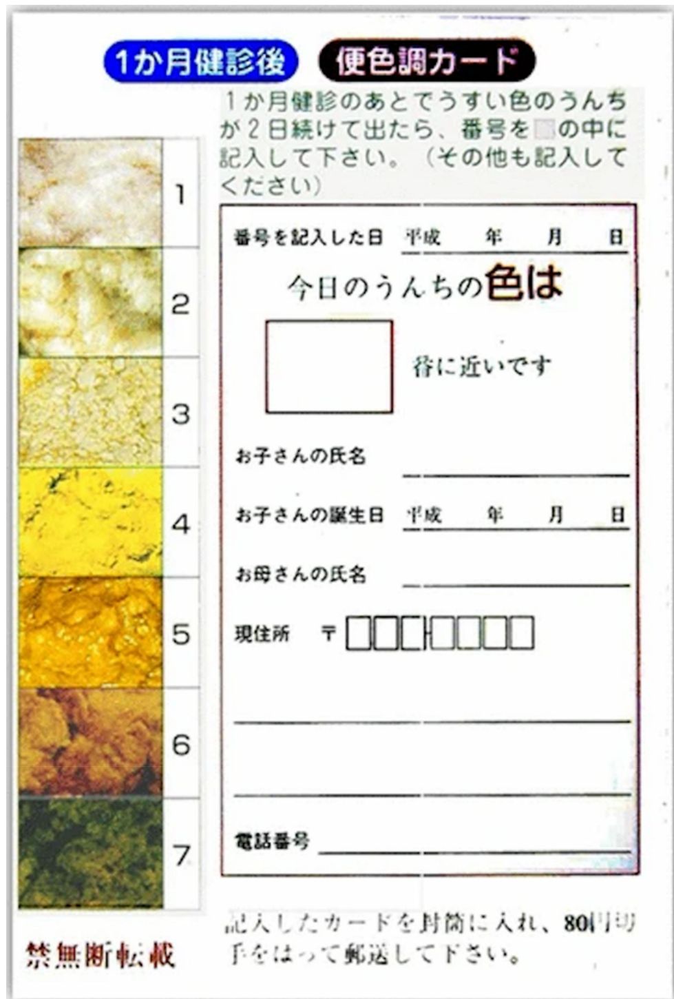
Figure 2. The Matsui stool colour card. This is the first version of SCC in Tochigi Prefecture, Japan. It was delivered to all pregnant women together with a “Maternal and Child Health Handbook”. Stool colors were numbered. Images 1–3 were pale-pigmented, and images 4–7 were bile-pigmented stools. A mother is asked to compare the colour of her infant’s stool to that of the card, to fill in a corresponding number just before the 1-month health checkup, and to hand it to the attending doctor. When pale-pigmented stools were suspected, the doctor reported to the SCC office by telephone or fax immediately; otherwise SCC were returned to the office by post weekly. The figure is provided to respectfully acknowledge the ground-breaking work of Professor Akira Matsui who passed away in 2020. There are now several versions of the SCC in many languages that are used for BA screening around the world. (Matsui [36], © 2013 reprinted by the permission of Springer Nature).