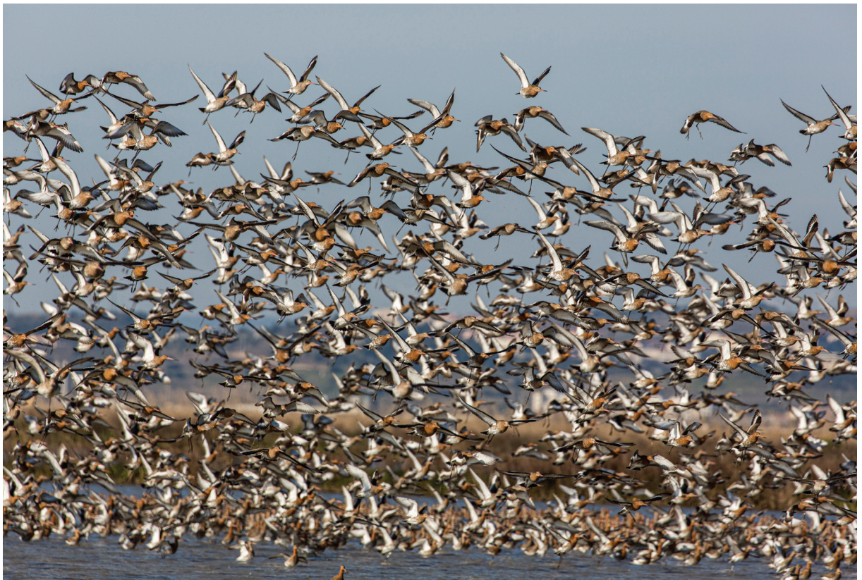
A flock of Black-tailed Godwits staging in the Tagus Estuary where they prepare for their northward migration (Tagus Estuary; Portugal, 19 February 2015).

Continental Black-tailed Godwits Limosa l. limosa (hereafter Godwits) are long-distance migratory shorebirds breeding across much of lowland Europe and rely on a distinct number of staging sites during migration (Beintema & Drost 1986, Hooijmeijer et al. 2013, Verhoeven et al. in prep.). Wintering birds can be found on the Iberian Peninsula, Greece, the Black Sea coast, North Africa and in sub-Saharan Africa (Beintema & Drost 1986, Zwarts et al. 2009, Gerritsen et al. 2015). Recent work on the migration ecology of Godwits has focused on staging populations at the Iberian Peninsula and a breeding population in southwest Friesland, The Netherlands (Hooijmeijer et al. 2013, Kentie et al. 2017, Senner et al. 2015, 2018, 2019, Verhoeven et al. in prep., 2018, 2019). Briefly, this work revealed a