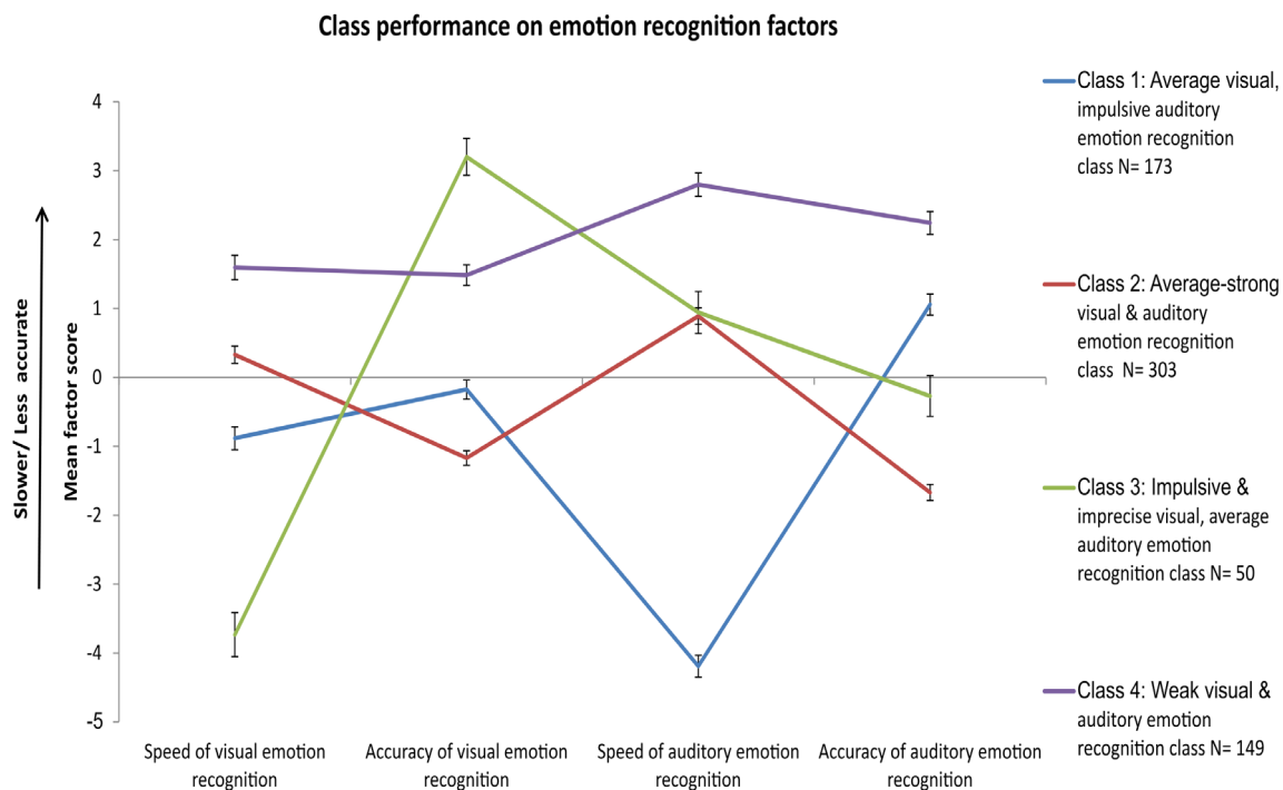
FIGURE 1 Emotion recognition subtypes identified in Waddington et al. (2018a). Each line represents the emotion recognition class (mean factor scores—speed and accuracy of Identification of Facial Expressions and Affective Prosody tasks, from the Amsterdam Neuropsychological Test battery, \pm 1 SE) for each class. Lower scores represent faster reaction time and fewer errors made

using the Illumina Infinium PsychArray-24 v1.2 BeadChip genotyping platform. Quality control, principal components analysis (PCA), and imputation were performed using RICOPII, the Psychiatric Genomics Consortium (PGC) pipeline for GWAS (Lam et al., 2019). RICOPII default quality control parameters were used extensively. PCA was used to identify and exclude population outliers during quality control and the first four principal components were included as covariates to account for population stratification during association analyses. Imputation was carried out using as reference the European ancestry subset of the 1000 Genomes Phase 3 reference panel (1000 Genomes Project Consortium, 2015). SNPs with a minor allele frequency (MAF) < .01 , an imputation score of INFO < .8 , were excluded prior to the analyses, resulting in 5,064,466 SNPs in the NeuroIMAGE dataset and 4,935,261 SNPs in the BOA dataset.