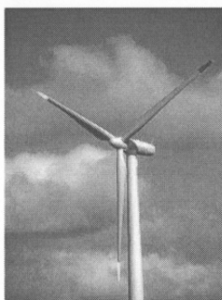
Wind Turbine: Photograph of Kirkheaton Wind Farm.

Rwindalelectric Inc is a newly developed non-profit organization which seeks to address Rwanda's energy