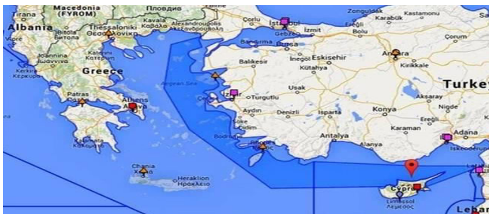
Figure 1: Turkish Claim in the Aegean

Source: Turkish coast guard. Available at: www.sahilguvenlik.gov.tr