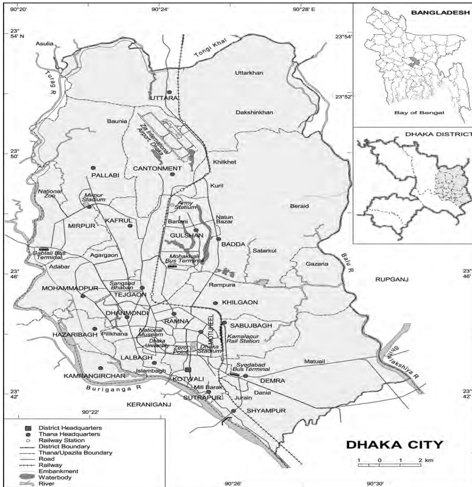
Map 1: Dhaka City

At the recent decade, Dhaka has emerged as one of the fastest growing megacities. It had a manageable population of 2.2 million in 1975 and that became 12.3 million in 2000. The growth rate of this urbanizing population during 1974-2000 was 6.9% (UN, 1998). There are very few other cities in the world, which has ever the experiences of having such a high growth rate in population during this period. Apparently the growth rate of urbanizing people in Dhaka City will also continue to remain high even in the coming years. At 2000-2015 the expected growth rate is 3.6% and will reach a total population of 21.1 million in 2015 (UN, 1999).