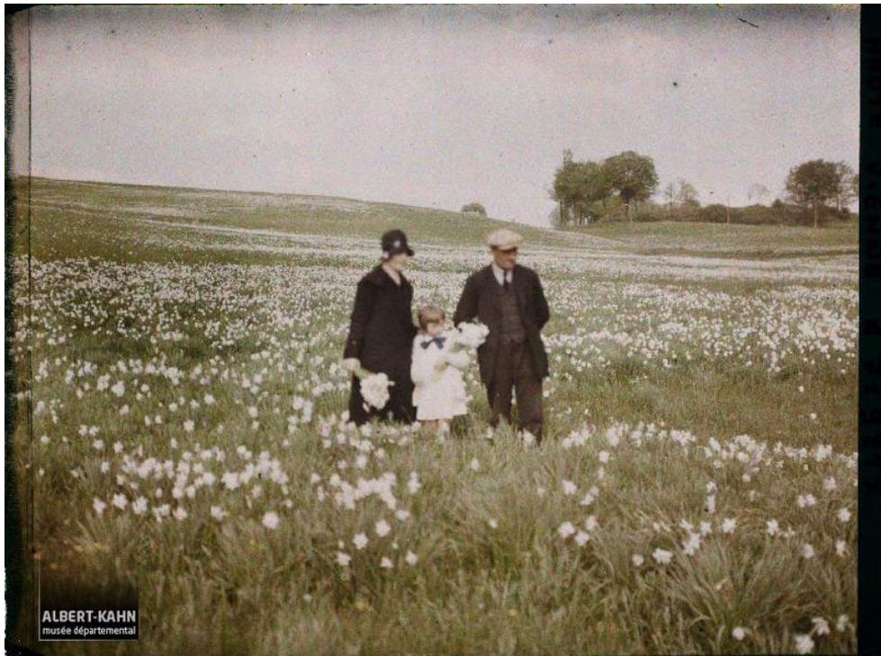
Fig. 3: Stéphane Passet, "Subjects: Family, Flower, Flowering Meadow," May 1929, close to Saint-Yrieix-la-Perche, France. (inv. A 71921, Collection Archives de la Planète - Musée Albert-Kahn/Département des Hauts-de-Seine, http://collections.albert-kahn.hauts-de-seine.fr/ ).

homogeneous groups, all members of the same gender, in everyday attire and in their usual surroundings. However, in comparison, the autochrome taken on the island of Marken close to Amsterdam makes evident the historical distance that separates today's beholder from the subject. One could attach the label "folkloristic" to the image showing four women in traditional clothing in front of a shop; after all, the "Archives de la Planète" were meant to document ways of living that were in danger of disappearing. But the ethnographic gaze at work only increases the impression of temporal and spatial distance.