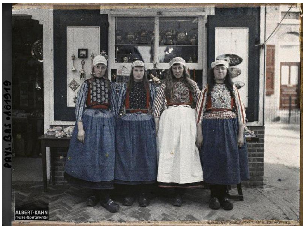
Fig. 4: Stéphane Passet, Four women in local dress. September 29, 1929, Marken, Netherlands. (inv. A 61919, Collection Archives de la Planète - Musée Albert-Kahn/Département des Hauts-de-Seine, http://collections.albert-kahn.hauts-de-seine.fr/ ).

us to date the picture rather accurately in the 1920s. Moreover, the impression of distance is enhanced by the fact that the faces appear blurred.