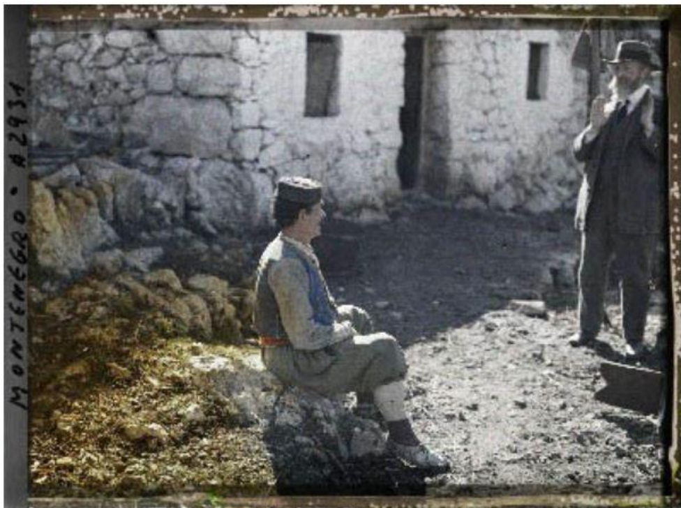
Fig. 5: Auguste Léon, Brunhes and a seated man. October 23, 1913, Cetinje, Montenegro (inv. A 2931, Collection Archives de la Planète - Musée Albert-Kahn/Département des Hauts-de-Seine, http://collections.albert-kahn.hauts-de-seine.fr/ ).

This attempt was, accidentally, documented on a few autochromes from one of the first missions. In 1913, Brunhes personally directed the shootings on the voyage that led him and photographer Auguste Léon to Montenegro. It happened that Brunhes got caught on an autochrome himself while he was giving instructions to a man in preparation for a portrait (fig. 5), thus documenting the process of documentation.