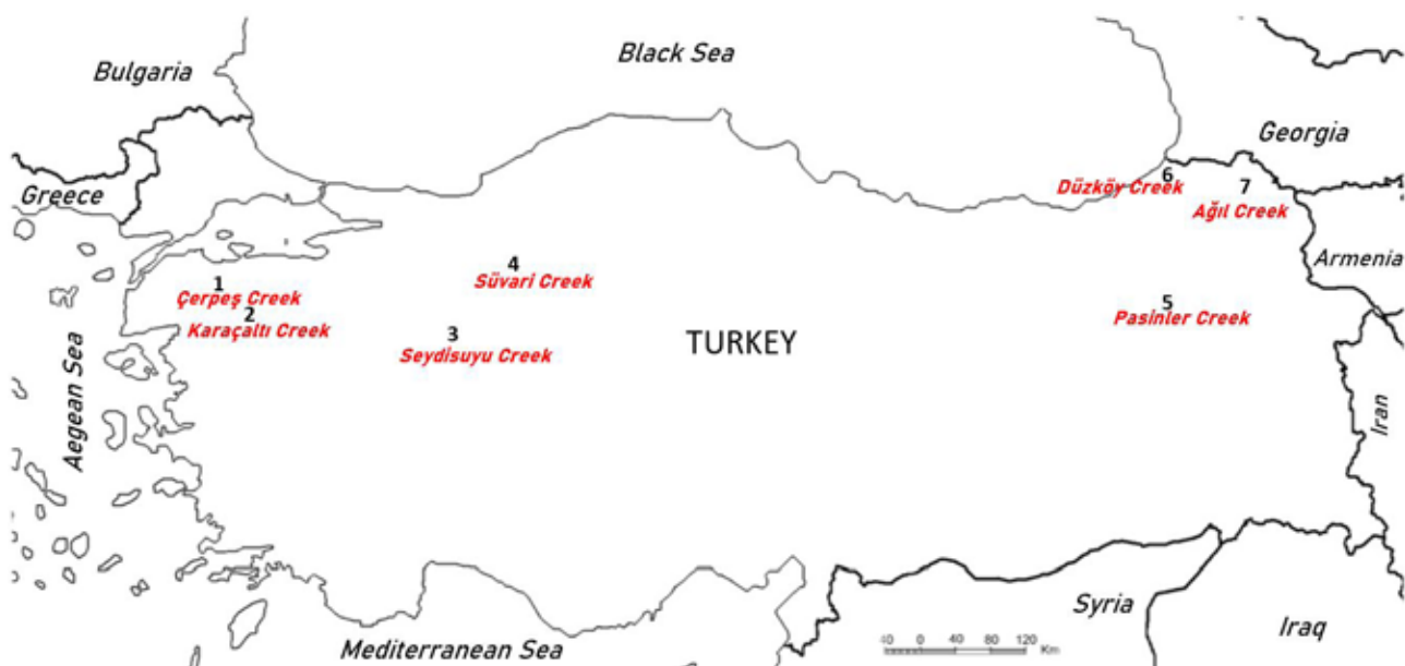
Figure 1. Map of sampling localities

Overall, 153 individuals from eight fish species belong to 2 families (Cyprinidae and Cobitidae) and 5 genera were analysed: Alburnus escherichii Steindachner, 1897 (Caucasian bleak); Alburnus filippii Kessler, 1877 (Kura bleak); Capoeta tinca Heckel, 1843 (Anatolian khramulya); Chondrostoma angorense Elvira, 1987 (Ankara nase); Chondrostoma colchicum Derjugin, 1899 (Colchic nase); Cobitis taenia Linnaeus 1758 (Spined loach); Squalius pursakensis Hankó, 1925 (Sakarya chub) and Squalius turcicus De Filippi, 1865 (Transcaucasian chub). The study was carried out during 2010-2018 years. Fishes were collected from seven different locations (Seydisuyu Creek, Pasinler Creek, Süvari Creek, Düzköy Creek, Çerpeş Creek, Karaçaltı Creek, Ağıl Creek) (Figure 1) capturing five different river basins of Turkey: Aras, Çoruh, Sakarya, Marmara and Susurluk.