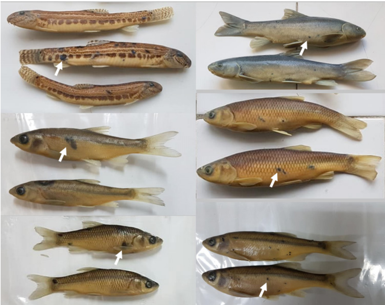
Figure 3. Black spot disease found in selected fishes in the present study

Grossly affected fishes exhibit multifocal black spots in the skin which were different in shape and diameter. Black spots were localized in all skin regions from mouth to caudal fin (Figure 3). In some fish hyperemia was observed around the lesions.