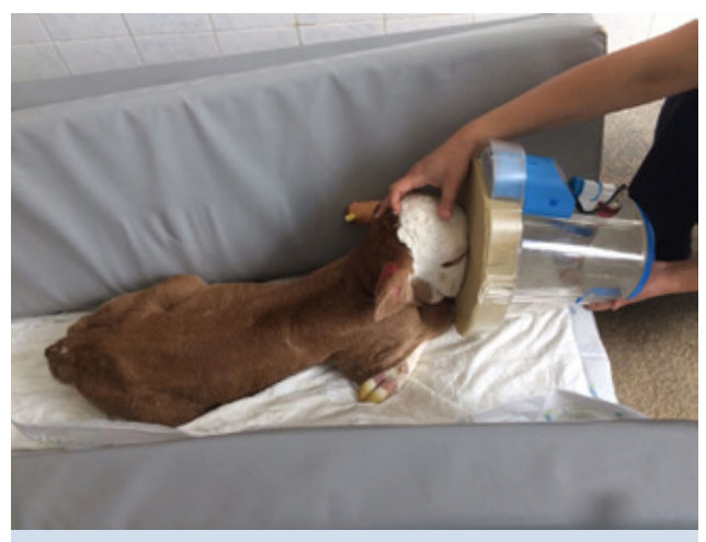
Figure 1. Nebulized drug admistration to premature calves.

Brand names of the drugs and dosages enrolled in the study as follows; FM (VENTOFOR, Liconsa A.S, Spania), 15 µg totally, BID, 3 days; IB (ATROVENt, Boehringer Ingelheim, Istanbul, Turkey), 2 µg / kg, BID, 3 days, FS (DIURIL, Vetaş, İstanbul, Turkey), 1 mg/kg, BID, 3 days, FP (FLIXOTIDE, GlaxoSmith-Kline, Australia), 15 µg/kg, BID, 3 days. Each drugs were diluted with 2.5 mL saline solution and were administered for 5 min using a nebulizer machine (Fig 1).