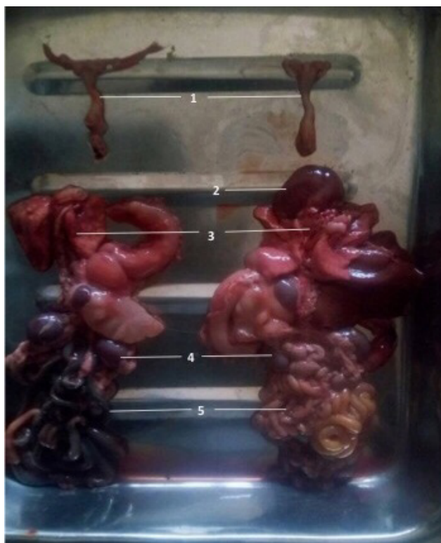
Figure 5. Photograph showing a comparison of the internal organs recovered from each twin. 1. Uterus 2. Single heart 3. Inflated lungs 4. Kidneys 5. Intestines