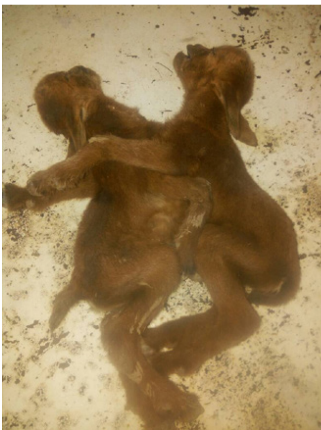
Figure 2. Conjoined kids, showing two components referring to the left and right twin, named kid A and kid B.

Autopsy revealed complete fusion of the thoraxes and abdomen to the caudal umbilicus at ventral mid-line, two pairs of normal rib cages ventrally joined by 2 sterna, two completely divided but attached thoracic cavities containing only one hypertrophic heart (located only in kid B with two branched aorta emanating from the left ventricle; each branch supplies the organs of the individual twin component), and complete bilateral duplication of the well aerated lungs (Figure 4). The ribs formed the lateral walls of the two thoraxes, articulated with the facets of thoracic vertebrae on the median plane and ventrally to the sternum. The attached thoraxes were separated from the abdomen by a single diaphragm. In the abdominal cavity of each twin, the gastrointestinal tract was duplicated containing esophagus, four compartment stomachs (rumen, reticulum, omasum and abomasum), spleen, pancreas and intestines (duodenum, jejunum, ileum, caecum, colon and rectum); however, a single enlarged liver and a gall bladder were found only in kid B. Each twin contained a normal urogenital system in the characteristic anatomical positions (Figure 5). There were uterus, two kidneys, ureters and bladder that discharged into a urethra, duplicates of anus and vulva on each component.