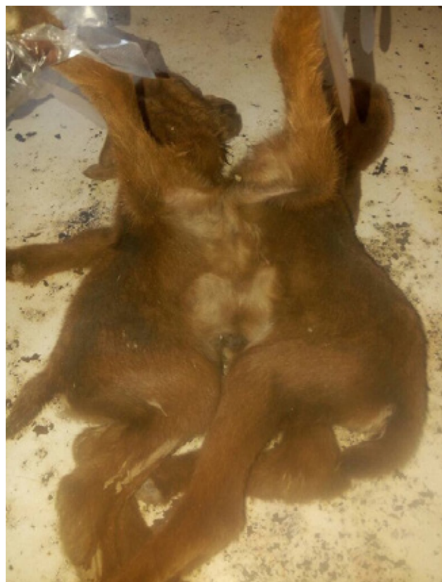
Figure 3. Lateral view of the conjoined twins showing fusion of thoraxes and abdomen to point of umbilicus.