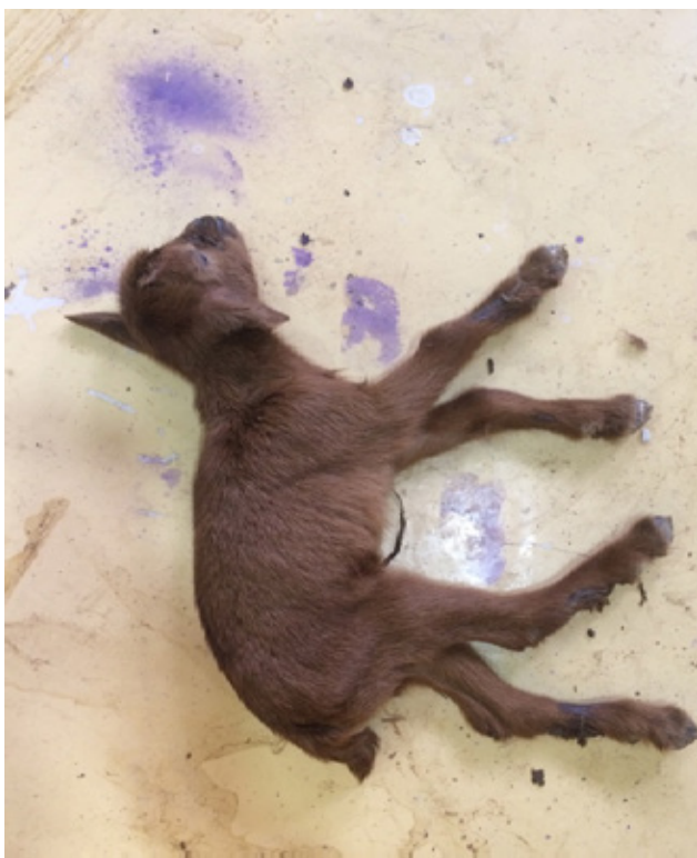
Figure 1. Normal male kid.