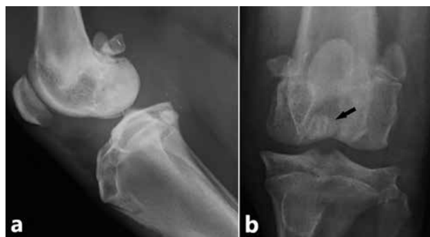
Figure 1. Mediolateral (a) and caudocranial (b) radiographs of the left stifle one month after both CLs rupture. Moderate joint effusion with reduced visibility of the infrapatellar fat pad. The popliteal sesamoid appears caudodistally displaced. At least three bone opacities are visible superimposed on the lateral surface of the medial femoral condyle (arrow) that likely reflect the multiple fragments of an avulsion fracture at the origin of the caudal cruciate ligament in the intercondylar fossa identified surgically. Slight new bone formation is visible on the patellar apex and on the distal aspect of the medial gastrocnemius sesamoid bone is also visible+

Two months after surgery the lameness of the operated limb was very mild, while after 8 months the gait seemed to be normal on observation. Pain and crepitus were not clinically identified in the stifle. Osteoarthritic lesions were mainly restricted on the intercondyloid eminence and the lateral fabella. Two years postoperatively, the clinical view of the dog was unchanged, while signs of mildly worsened left stifle osteoarthritis were identified radiographically (Figure 3).