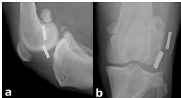
Figure 3. Mediolateral (a) and caudocranial (b) radiographic views of the left stifle taken 2 years after extracapsular stabilization. There is mild increased new bone formation, most notably on the intercondyloid eminence and the lateral gastrocnemius sesamoid bone. Small osseous opacities are superimposed medially and caudally on the joint. The lucent area visible in the tibial tuberosity seen on the lateral view represents a hole drilled to pass the suture material in connection with the extracapsular stabilization procedure. Crimps are noted on the lateral aspect of the stifle. Moderate joint effusion is still visible, mildly less than preoperatively. Mild thickening of the patellar ligament is also visible