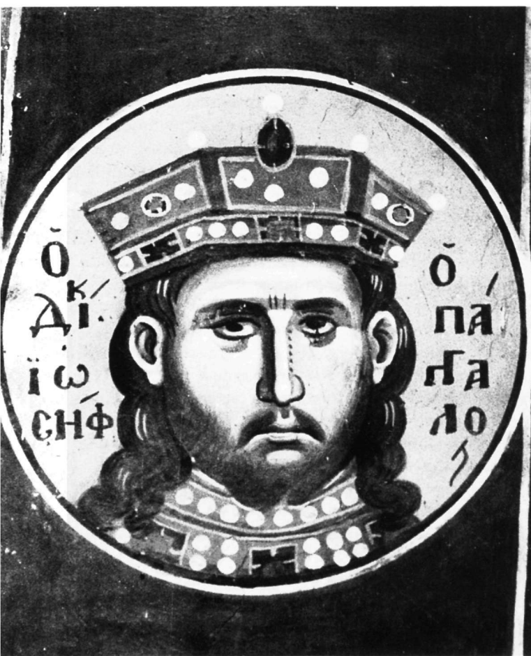
Fig. 3. Ohrid, Church of the Virgin Perivleptos. The Beateous Joseph. 1295.

Ο ΠΑΓΓΑΛΟΣ (Fig. 3) 26 . In the upper zones of the naos of the church of St George at Staro Nagoričino (1316-1318) there are also paintings of the Old Testament virtuous: Samuel, David, Solomon, Noah, Job, Zaccharia, Moses, Melchisedek, Aaron, Joshua and the Beateous Joseph ([ΙΩΧΗΦ] Ο ΠΑΝ[ΚΑΛΟΣ]) (Fig. 2) 27 . In the northwest dome of Gračanica (1318-1321) Joseph, along with Joshua, joins the Old Testament kings Manasseh, Amon and Hosea and the inscription running beside him is well preserved: Ο ΔΙΚ(ΑΙΟΣ) ΙΩΧΗΦ Ο ΠΑΝΚΑΛΟΣ 28 . In all these monuments the painters Michael and Eutybios depict Joseph as a young man and, probably influenced by his triumph in the cycle, in regal attire, wearing a crown, a divitision and a loros. His appearance and the iconographic context within which he figures at the Chora in Constantinople (1316-1321) are somewhat different from the above mentioned. Joseph (ΙΩΧΗΦ) is shown as an old man with a long beard, dressed in a chiton