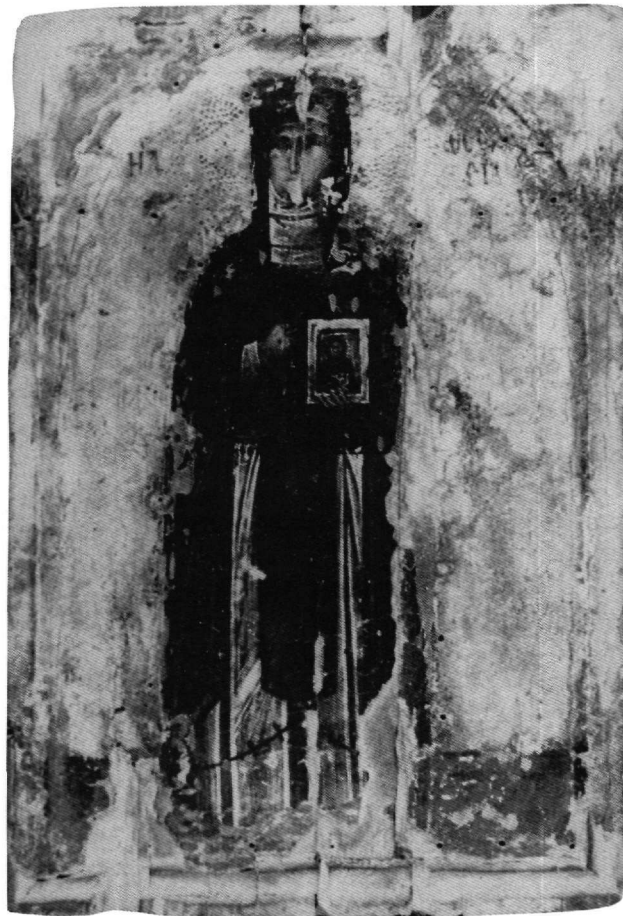
Figs 1-2. Mount Sinai, Monastery of St. Catherine, icons; St. Theodosia.

ing, is gold. However, from the shoulders downwards, the background has not been cleaned and retains the brown overpainting. The gold part of the background has revealed the original inscription: Η ΑΓΙΑ (ΘΕ)ΟΔΟCΙΑ .