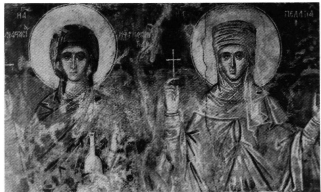
Fig. 3. Haghia Paraskevi, Amari, church of Panaghia, fresco: Sts Anastasia and Pelagia (Photo after K. Gallas - K. Wessel - K. Borboudakis, Byzantinisches Kreta, Munich 1983, fig. 80 ).

The cover or hood falls over the cap and on the shoulders and it is closed in front of the neck leaving out the face only. A similar headdress is worn by Helen, the widow of Staphan Uroš I at Arilje in Serbia from about 1296 15 . In later examples the veil covering the cap becomes more sophisticated falling over the shoulder on