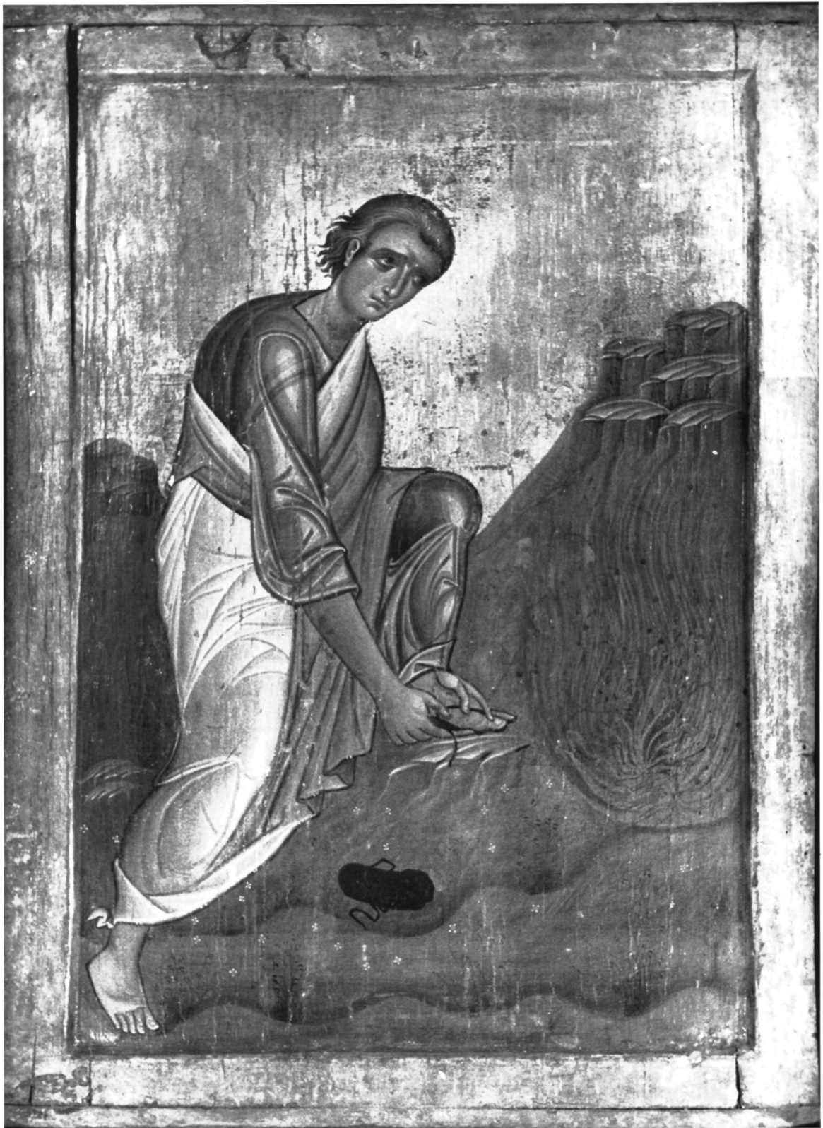
Fig. 1. Sinai. Monastery of St. Catherine. Icon. Moses and the Burning Bush.