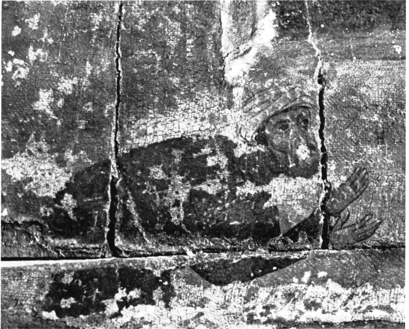
Fig. 8. Moses and the Burning Bush. Detail.

formed by the right foot of Moses, the lower hem of his himation, the left foot, and the hillside crowned by the cubist peaks counterbalances the diagonal thrust of Moses reaching for the tablets extended to him by the Hand of God in the companion panel (Fig. 2).