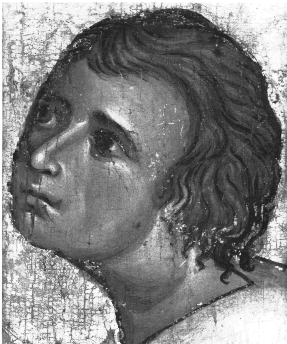
Fig. 4. Moses Receiving the Tablets of the Law. Detail.

fold of the white surfaces of Moses' himation are indicated by light blue, and its contour in the central area is enlivened by double white dots. Black is used occasionally to outline the drapery where it is necessary to distinguish the forms more clearly. The drapery adheres softly to the body enhancing its plasticity. Moses' face is modeled with ochre producing broad lighted areas, with white highlights at the bridge and the tip of the nose, above the upper lip, at the corners of the mouth, and also on the chin. Vivid red in various shapes is freely placed on the cheeks, the bridge and tip of the nose, the lips, on the contour of the chin, and also at the edges of the forehead. Olive shading is restricted mainly to the area around the eyes. Moreover, warm tonalities predominate in the modeling of the neck, of the arms,