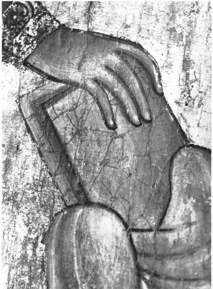
Fig. 5. Moses and the Burning Bush. Detail.