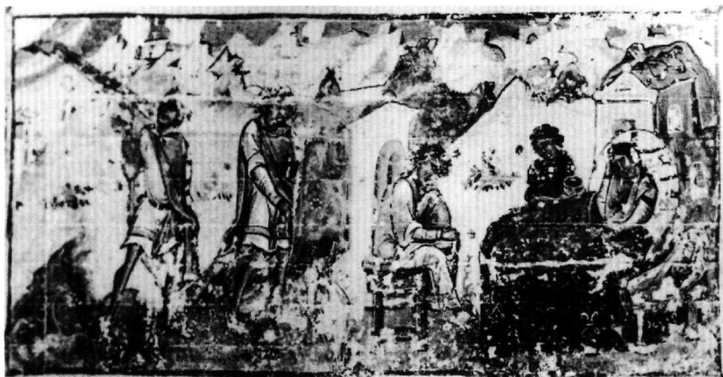
Fig. 6. The birth of Henoah, Rome, Lib. Apost. Vat., gr. 747, fol. 26r, c. 1070.

copyist of the Octateuch preferred to illustrate only one of them.