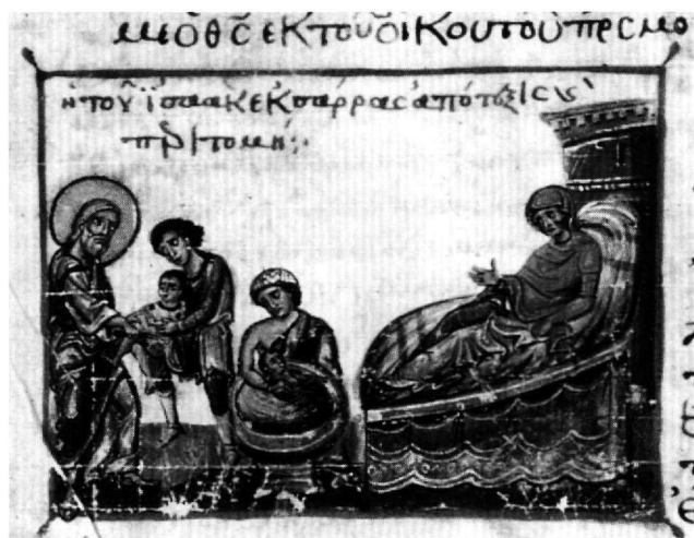
Fig. 4. Sarah giving birth to Isaac, Rome, Lib. Apost. Vat. gr. 746, fol. 79r, c. 1150.

Byzantine artistic inclination to make every element visible in the composition 37 .