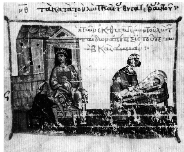
Fig. 2. Daughter of Lot bearing Ben-Ammi; a second daughter attending to Moab, Rome, Lib. Apost. Vat., gr. 746, fol. 77v, c. 1150.

her marital status 25 , or white bands, her hair is dishevelled 26 . All these features are illustrated in the depiction of Rachel in Vat. gr. 747, fol. 56v (Fig. 1) and Lot's daughter in Vat. gr. 746, fol. 77v (Fig. 2). The parturient, facing front, is seated on a bench (designating the birthing stool of late antique imagery) 27 , or crouching, her legs wide apart, pressing one hand against her uterus and the other on the midwife's head; both gestures indicate labor pain, as exemplified by the figure of Rebecca giving birth in Vat. gr. 747, fol. 46v (Fig. 3). The midwife, seated on the ground or on a low stool beside the parturient, usually on her right (Fig. 2), supervises the infant's egress. The woman depicted is giving birth to one or two infants; one is represented 'plunging forward', head first, from his mother's legs, while the other appears lying on