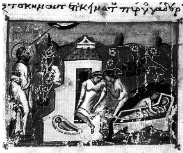
Fig. 1. Rachel giving birth to Benjamin, Rome, Lib. Apost. Vat., gr. 747, fol. 56v, c. 1070.