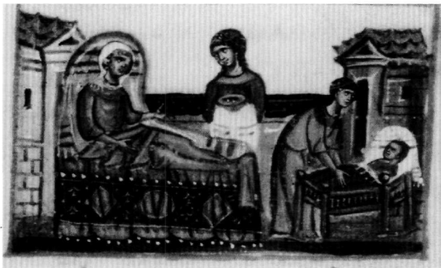
Fig. 5. Samson's birth , Rome, Lib. Apost. Vat. , gr. 746, fol. 490r, c. 1150 (photo: Biblioteca Apostolica Vaticana ).

infant was worth rearing and severed the umbilical cord 44 , the physician urged her to proceed without delay to bathe the newborn so as to remove the amniotic fluid from his body: "After having cleansed the body, one must bathe it with lukewarm water and wash away all the covering emulsion" 45 . Ernst Kitzinger has argued that the Hellenistic motif of bathing the infant 46 influenced illustrations in the early illuminated Bibles; these, in turn, were the source for the iconography of the New Testament, such as the Nativity 47 ,