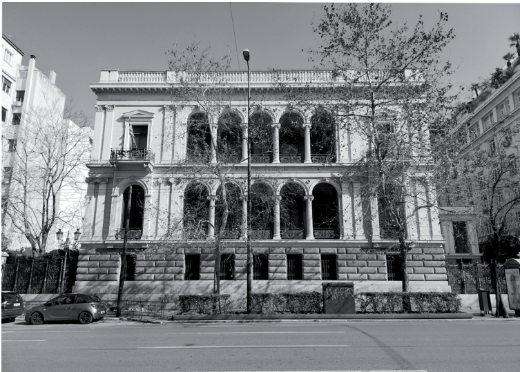
Fig. 4. Iliou Melathron (Numismatic Museum), Athens.

Leaving the Archaeological Museum and heading towards Syntagma Square via Panepistimiou Street, the visitor will encounter the DAI on Fidiou Street (fig. 1), which, after its establishment in 1874, was housed in this neoclassical building that was commissioned by Schliemann and purchased by the German state in 1898. 55 It is perhaps fitting that a bust depicting him can also be found here, marking his association with the institute and, by extension, his position as a founding father of archaeology in Greece. On Panepistimiou Street, the visitor passes through the neoclassical trilogy of Athens (the National Library, the University of Athens and the Academy of Athens), followed by the city's first ophthalmological hospital; in the opposite corner one finds the building of the Archaeological Society at Athens (fig. 1), where Schliemann is commemorated by a stele in the main lobby among other great donors. A photo of the archaeologist in Mycenae was displayed in a recent exhibition dedicated to the excavations conducted by the society. 56 A few meters beyond the Archaeological Society one can see Schliemann's mansion (fig. 1), known as the Iliou Melathron (fig. 4), which today houses the Numismatic Museum. Portraits of Schliemann and Sophia hang on the walls, and an entire room is dedicated to their personages (fig. 5).