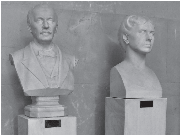
Fig. 2. Busts of Heinrich and Sophia Schliemann at the entrance to the National Archaeological Museum, Athens.