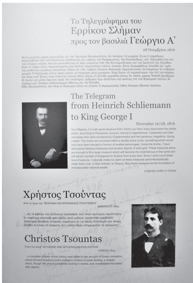
Fig. 3. Schliemann’s telegram to George I, National Archaeological Museum.

Furthermore, his discoveries from Mycenae are installed in Room 4 after the main entrance in the central wing, which is the most prominent part of the entire museum. In one of the walls in the centre of the room, opposite the display case containing the “mask of Agamemnon”, a poster reproducing a telegram from Schliemann to George I is displayed on the wall (fig. 3), which confirms that he donated all the findings to the people of Greece, a testament to Schliemann’s philhellenism.