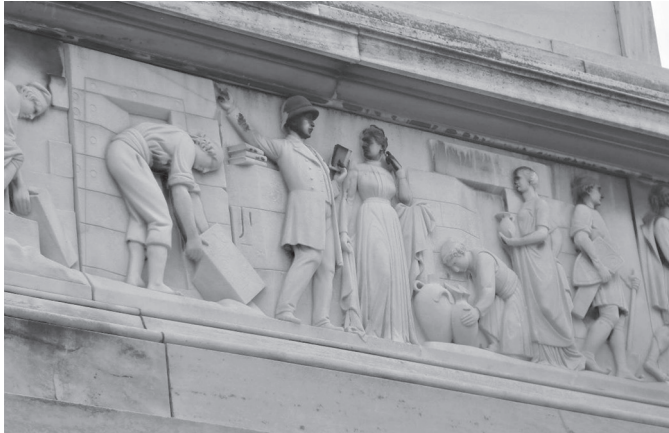
Fig. 7. Frieze on Schliemann’s tomb depicting Sophia and him, First Cemetery, Athens.