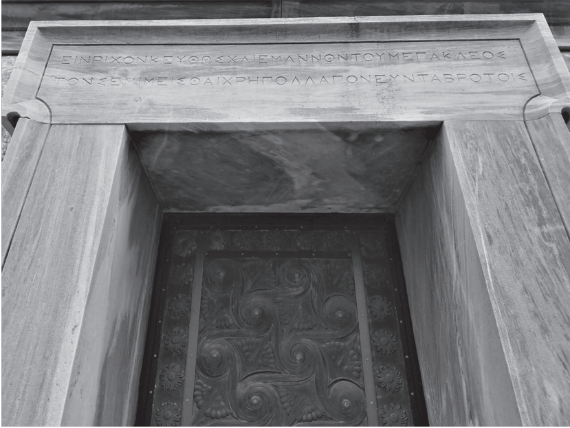
Fig. 10. The bronze door on Schliemann's tomb, First Cemetery, Athens.

On Blegen's grave, the symbol is carved on the tombstone but on Schliemann's tomb it is engraved in the bronze front door (fig. 10). 86 Even Furtwängler's grave, with the magnificent bronze sphinx, is restricted to a much smaller space (fig. 11). That these two archaeologists chose to have more modest burial monuments compared to Schliemann's is a testament not only to their lower economic status but also to their desire to emphasise their work instead of their personalities and self-proclaimed heroism. But be that as it may, in the end, it was Schliemann's megalomania and fervent desire for posthumous glory that prevailed since it is he who has left his mark in the world of Greek archaeology, he who is most remembered to this day by the public, and he who appears in school textbooks as the preeminent figure of his era, even if academics today do not recognise him as a great archaeologist.