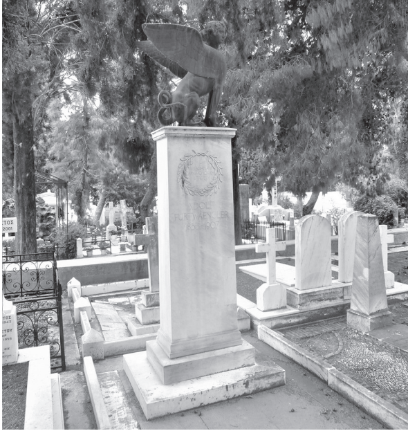
Fig. 11. Furtwängler's grave. The low enclosure of the Protestant section of the cemetery can be seen behind the tomb.