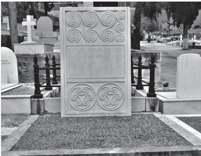
Fig. 9. Blegen's grave in the First Cemetery.