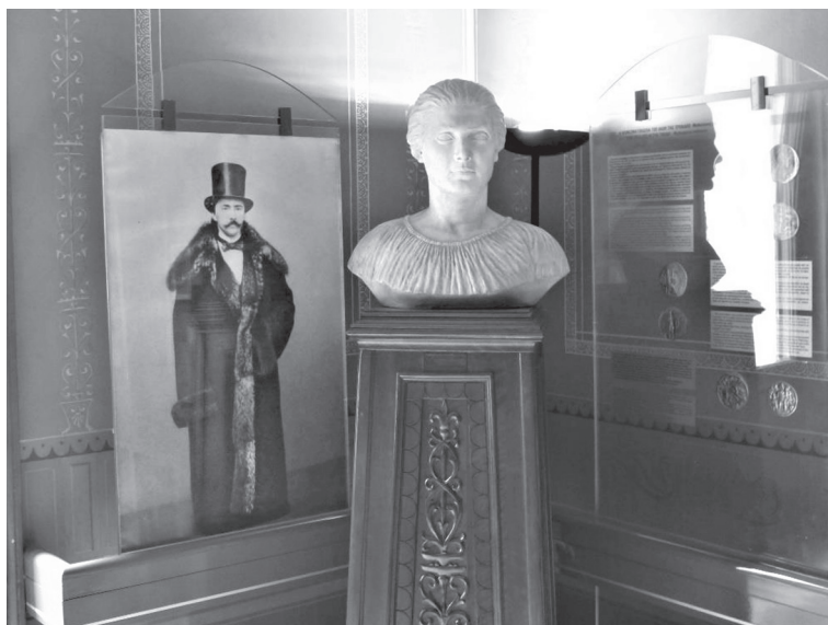
Fig. 5. Images of Heinrich and Sophia Schliemann in the Iliou Melathron (Numismatic Museum).

Unlike Schliemann's tangible presence in Athens, a comparative search for monuments dedicated to Stamatakis is revealing, but perhaps not surprising. Although he was general ephor of antiquities, a senior member of the Archaeological Society and an excavator of Mycenae and many other sites, his grave no longer exists in the First Cemetery (fig. 1), where illustrious figures are buried. Since the municipality of Athens considered the grave to be rather unimportant, Stamatakis' bones were thrown, in the best-case scenario, into a collective pit. 57 Stamatakis' memory is only preserved in the building of the Archaeological Society. His name, excavations, and some of his notes were on display in a special exhibition until 2017 but have now been moved to the archive room of the society. It is ironic that in the catalogue of the exhibition, a mural painting from a Roman tomb unearthed by Stamatakis, is published next to a photograph of Schliemann. 58 One