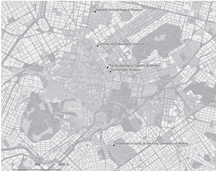
Fig. 1. Locations mentioned in the text. (Map by authors in QGIS using Stamen basemap.)

of his wife, Sophia (fig. 2), and of Greek archaeologist Christos Tsountas, is exhibited in the corridor by the main entrance.