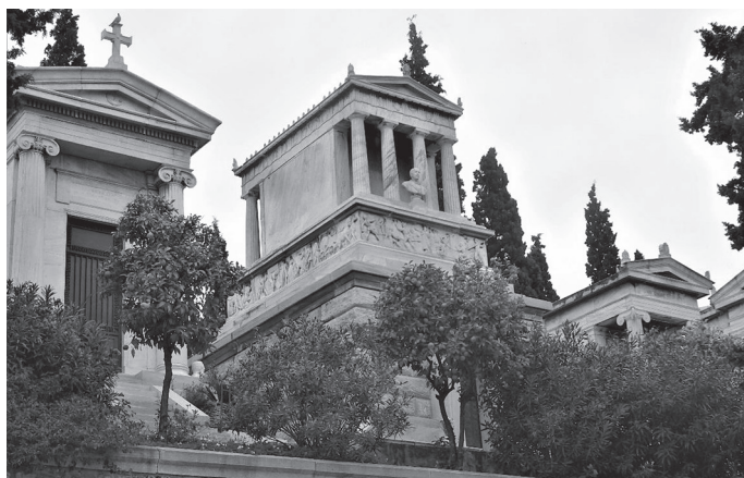
Fig. 6. Schliemann's tomb in the First Cemetery, Athens.

The construction of his residence in 1881 should be seen as a statement of a learned and wealthy individual that happened to be an antiquarian in a time when the new capital of Greece had just begun to grow. Perhaps it was also a testament to his place in the society of his time; after all, with his discoveries at Troy and Mycenae Schliemann had become an international celebrity. He had actively participated in the design and decoration of the house and in 1878 had conversed about these subjects with the German architect Ernst Ziller, who was responsible for designing many neoclassical buildings in Athens apart from Schliemann's house. 61 It is important to note that, by the time of its construction, it was one of the most impressive private residences in Athens; photographs and initial plans created by Ziller reveal that the mansion was to be constructed on a spacious plot, where it would be the most impressive building of its day, second only to the royal palace on Syntagma Square (now the parliament of the Hellenic Republic), which he designed in 1847. 62