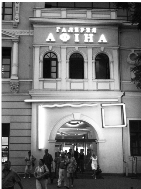
Fig. 1. The entrance of the Afina mall, former oval building of the Greek market in Odessa.

Small two-storey houses in the Balkan style have been preserved on the side streets that intersect with Grecheskaia Ulitsa. On Krasni Pereulok (Red Lane or Cloth Lane) at numbers 16, 18 and 20, three of these have been combined to house today the Hellenic Foundation for Culture. The original interiors have been preserved in the middle of the three, which was the grocery store and residence of the merchant Gregorios Marazlis. Members of the Philiki Etaireia, the secret fraternity founded in 1814 by Greek merchants to promote the liberation of the Greeks from the Turkish dominion and to plan the Greek War of Independence of 1821, met here. 37