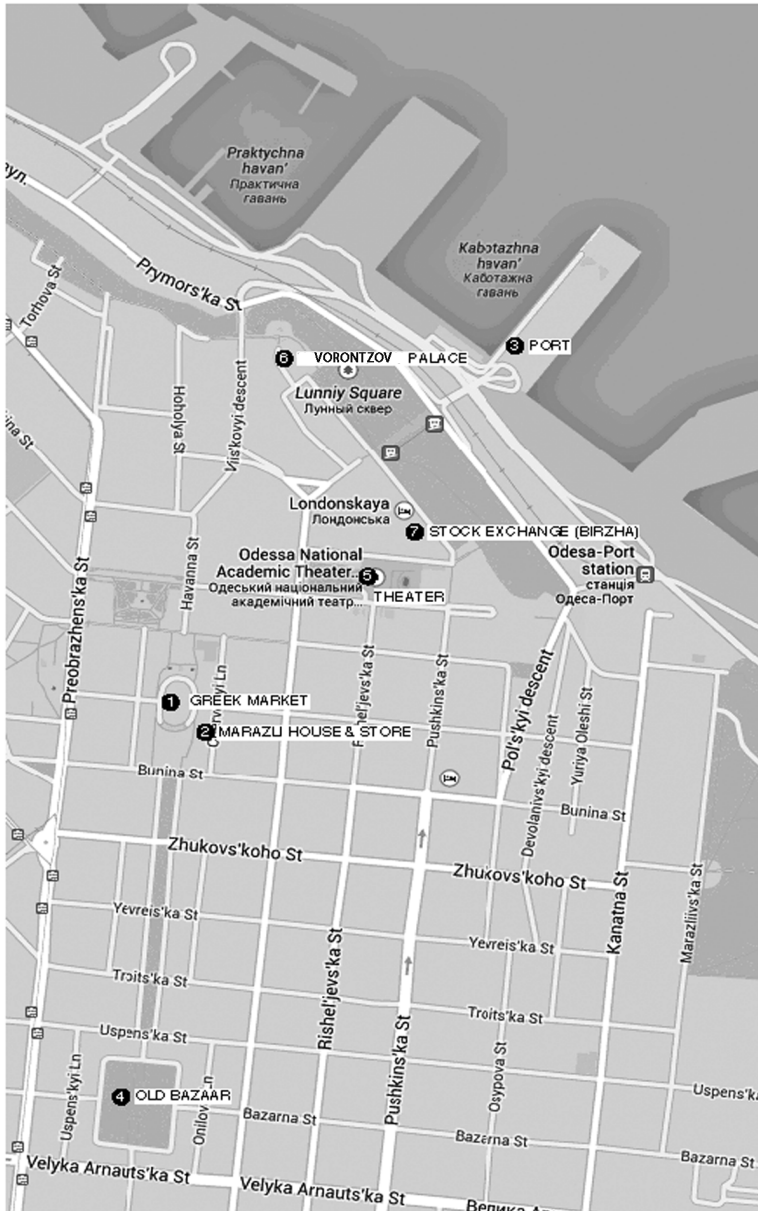
Map 1. Plan of the Bulvarnii quarter of Odessa indicating the Greek market and its proximity to the port.