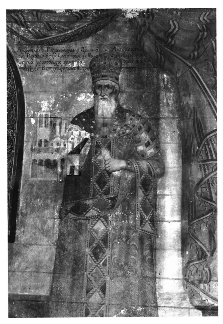
Emperor Andronicus Palaiologos, wall painting in the monastery of St Ioannis Prodromos, Serres, Greece.