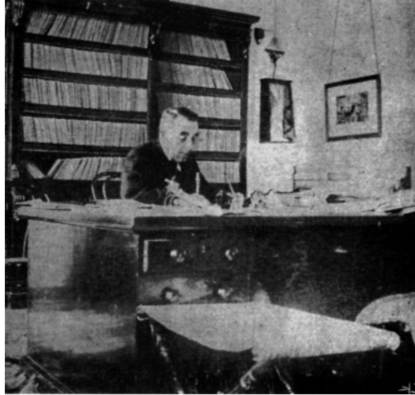
Dimitrios Vikelas in his study at the Society for the Distribution of Useful Books.