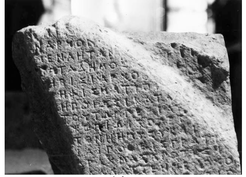
Fig. 5. Detail of its upper part.