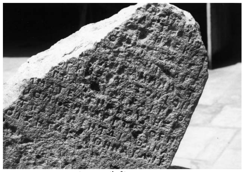
Fig. 2. Detail of its upper part.