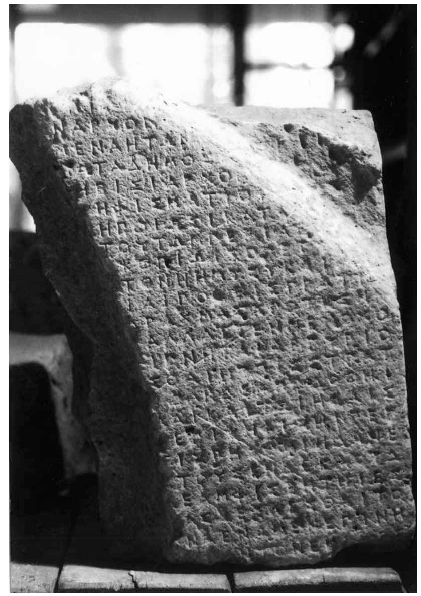
Fig. 4. The lower fragment of the Aphytis copy of the Athenian Standards Decree discovered in 1969 (Thessalonike Museum 6117).