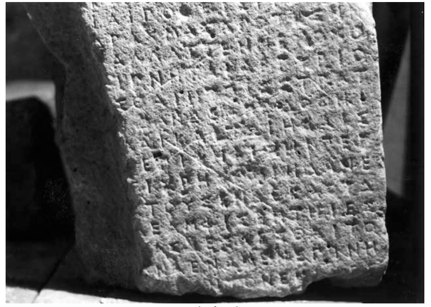
Fig. 3. Detail of its lower part.