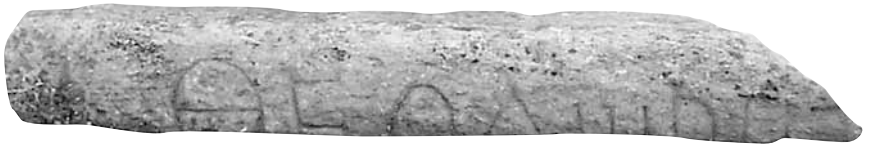
Fig. 14. Inscription no 10.