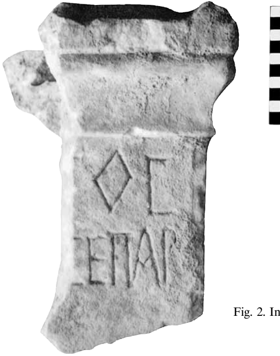
Fig. 2. Inscription no 2A.