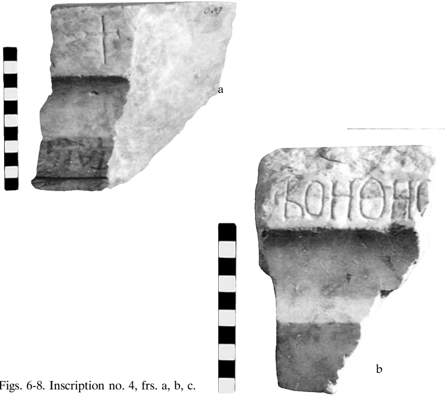
Figs. 6-8. Inscription no. 4, frs. a, b, c.