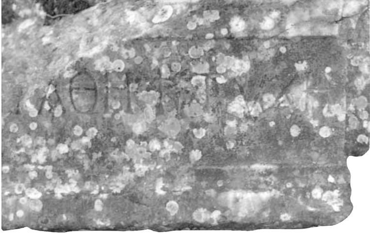
Fig. 12. Inscription no 8.