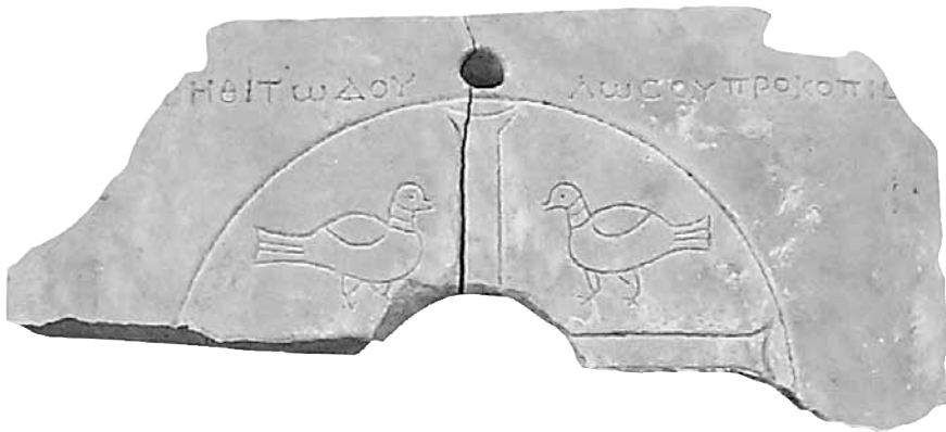
Fig. 5. Inscription no. 3 (detail).