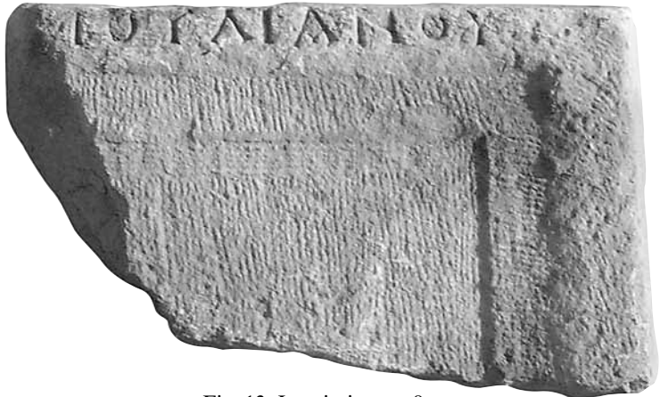
Fig. 13. Inscription no 9.