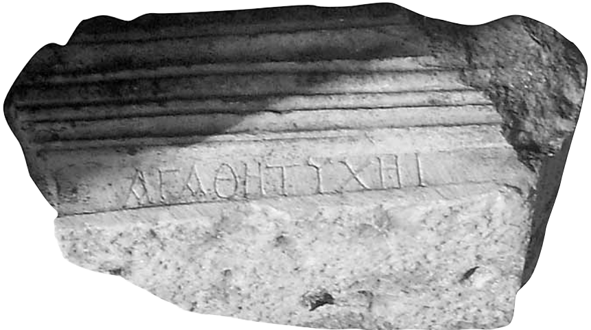
Fig. 11. Inscription no 7.