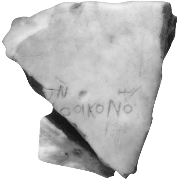
Fig. 10. Inscription no 6.