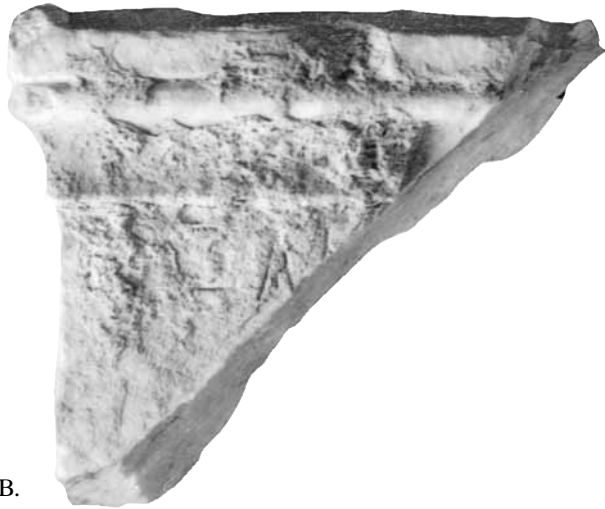
Fig. 3. Inscription no 2B.