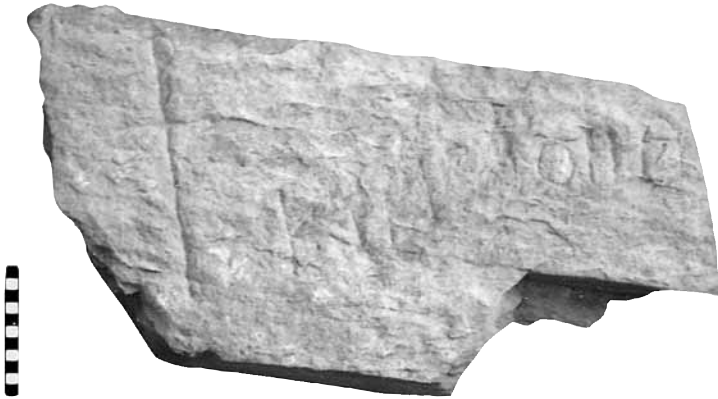
Fig. 9. Inscription no 5.

Christian inscriptions of the βοήθει/βοήθησον type are very common in Aphrodisias. 16