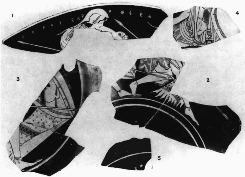
K. Görkay, Fig. 1. 1-5