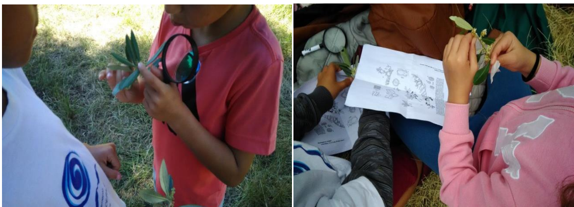
Figure 3 a, b - Students observing with magnifying glass various olive tree structural organs.