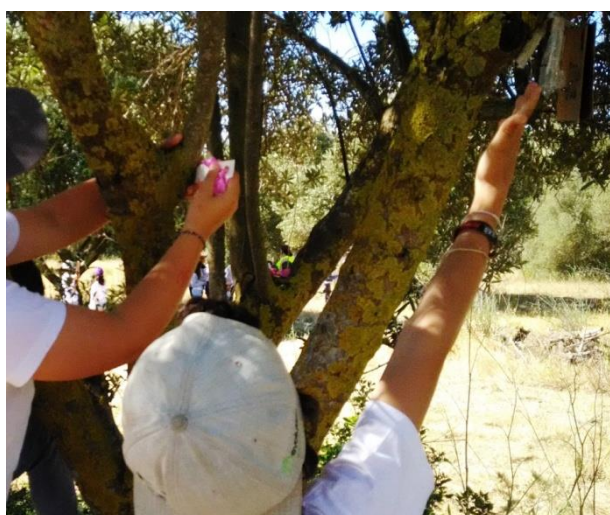
Figure 2 Labelling of olive trees by students.

Students observed different olive tree varieties and became aware of data about their phytogeography (e.g. countries that hold olive trees around the world both in North and South hemispheres); propagation methods (e.g. sexually or asexually); among other biological and agronomic facts (e.g. current challenges concerning olive tree disease resistance or biodiversity conservation issues). Students were also provided with magnifying glasses so that they could observe with greater detail organs and morphological structures such as flowers, leaf veins, among other aspects. Students labelled olive trees with a code number which matched to a specific variety name / country of origin (Figure 2).