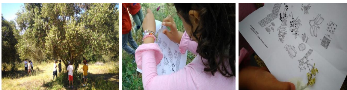
Figure 1 Students at the olive tree collection outdoor visit during the blooming and early olive fruit formation phases. The worksheet distributed had an illustration of various olive tree structural organs.

Students observed different olive tree varieties and became aware of data about their phytogeography (e.g. countries that hold olive trees around the world both in North and South hemispheres); propagation methods (e.g. sexually or asexually); among other biological and agronomic facts (e.g. current challenges concerning olive tree disease resistance or biodiversity conservation issues). Students were also provided with magnifying glasses so that they could observe with greater detail organs and morphological structures such as flowers, leaf veins, among other aspects. Students labelled olive trees with a code number which matched to a specific variety name / country of origin (Figure 2).