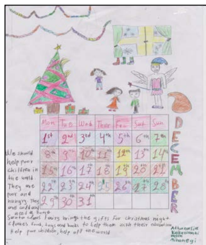
Figure 3 Santa Claus fairy: Offer of gifts to poor children in the world

The final remarks regarding both compositions as a whole revolve around the information value of top and bottom, namely what has been positioned as the 'Ideal' and the 'Real' in concrete zones so that the reader/ viewer of the intended messages draws concrete information from the constituent elements spatially arranged in the visual or bimodal composition. As has already been mentioned, during the main phase a template of a calendar page was given to the students to enable them to design their compositions. In composition A the Ideal, the upper zone of the image, is realized through the image/ language blending, since apart from the visual interaction of the homeless man and the Snowman, the dialogue precedes the visual text. As for composition B, the Ideal is realized only through the use of image, since their visual text is not as concise as that of composition A, therefore more space was required. What is represented in both compositions, however, is an ideal image of everyday reality where social problems can be eliminated due to the aid of superheroes. The zone of the Real which presents more specific and down-to-earth information uses a plain, everyday calendar to mark days as they go by, still playing partly a symbolic role concerning the passage of time when interpreted intersemiotically, since we all hope that the future can be promising and bring changes in the lives of all those who suffer.