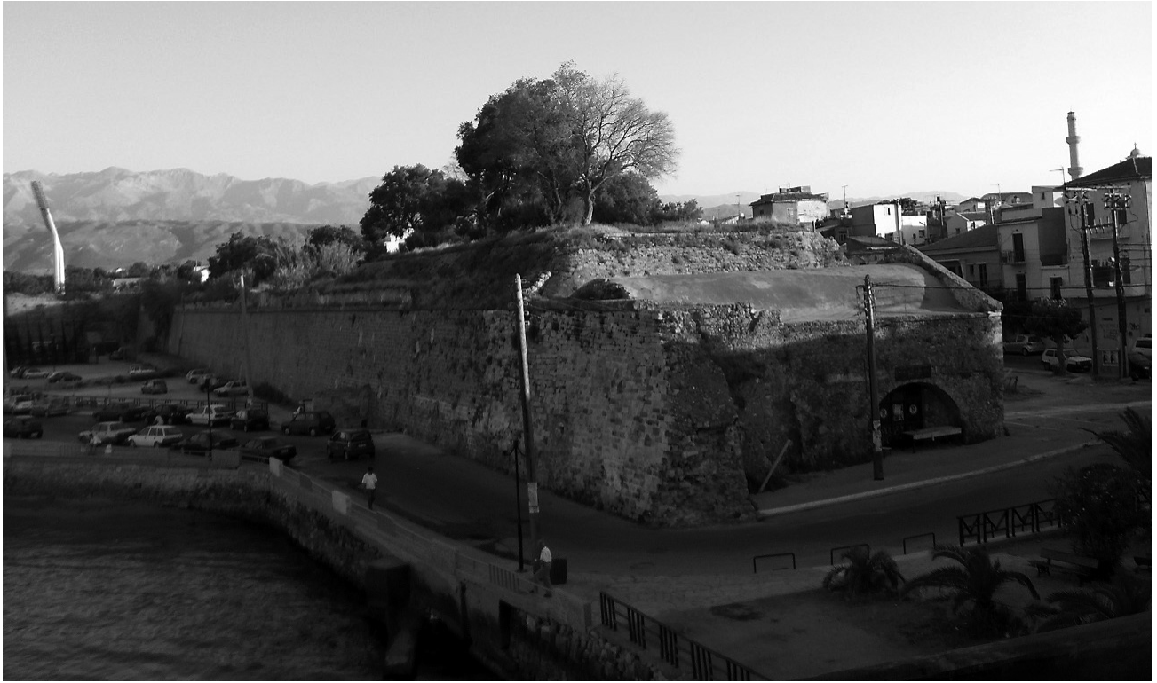
Fig. 1. Chania, Sabbionara gate. A part of the Venetian wall has been demolished to let the street pass through.

King Otto, to the codification of its occasional revisions in 1932, the legislation spoke of antiquities as well as ‘works of the ancestors of the Greek people’ 3 and there is no doubt that the overwhelming majority of those charged with implementing the legislation were not ready to include monuments that were neither ancient, nor Byzantine nor even ‘post-Byzantine’ in the familiar pattern of the history of the nation. Even though from the twenties on certain administrative regulations included building complexes from the Venetian and Ottoman periods, especially forts, in the buildings listed for preservation henceforth, these monuments were never actually integrated in the historic landscape of their region. They remained in a dilapidated state, without active protection, in run-down areas. The reasons for this were not, of course, entirely ideological, but rather mainly financial. The priorities according to which funds available for monuments were spent were determined by needs arising from the ideological framework for preservation and display of the ancient monuments, the rescue digs due to rebuilding in modern towns and the Western European interest in these monuments, whether