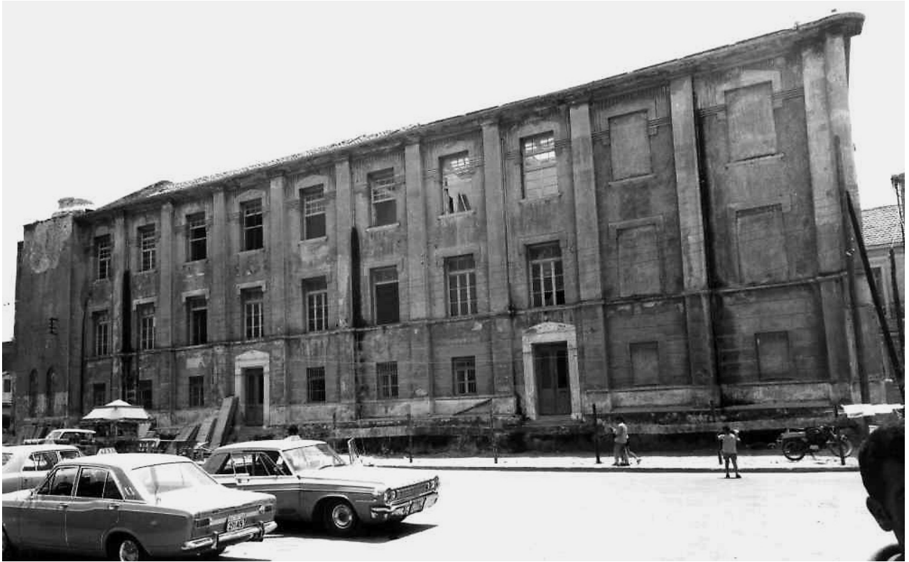
Fig. 4. Herakleion, San Salvatore during the demolition 1972.

adopted by the mendicant orders of the Roman Catholic Church. The building had many similarities with the Eremitani Church in Padua, which also belonged to the Augustinians. Moreover it was the only remaining Western-style medieval church on Greek soil which had preserved its entire shell until then. Naturally it was a deserted building, which had been unused for about a decade.