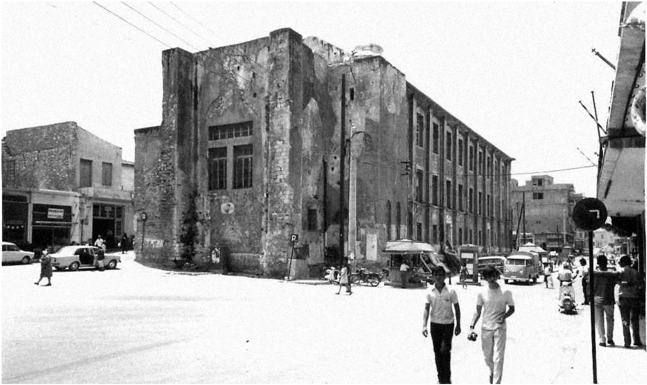
Fig. 3. Herakleion, San Salvatore before demolition, 1972.

as early as the end of the Ottoman period, when the Ottoman authorities were trying to modernize, and increased as soon as Crete won its independence. An example of this modernization is the construction of the Municipal Market in Chania, in itself an important piece of architecture of its time, which involved demolishing of the piatta-forma of the impressive sixteenth-century Venetian fortifications. 4 There was extensive demolition, especially between the wars, both for road widening and for reconstruction purposes. Thus in Herakleion and Chania parts of the marvellous sixteenth-century fortification walls were demolished to make way for arterial routes (fig. 1) and a large number of private houses were knocked down, parts of which dated back to the Venetian period. Though we have no direct evidence as regards the latter, we can deduce that this was the case from two indicators. The details of some of these houses had been photographed in the early twentieth century by the Italian scholar Giuseppe Gerola; by mid-century when the first attempts were made to preserve monuments from the Venetian period some architectural members, lacking documented provenance, were