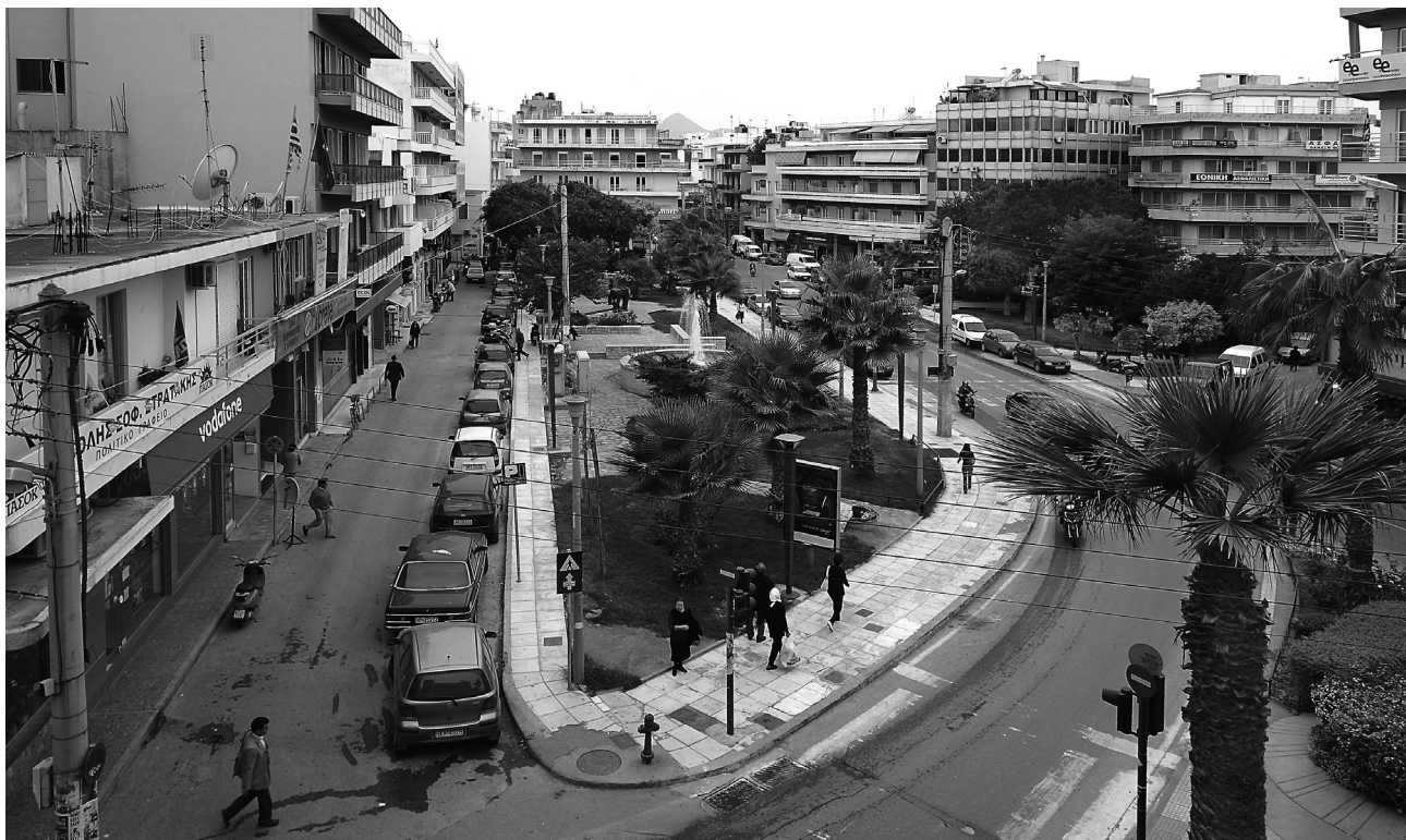
Fig. 5. Herakleion, Kornaros Square in place of San Salvatore.

multi-storey blocks of flats whose new owners wanted to look out onto squares.