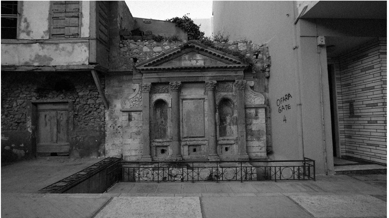
Fig. 12. Herakleion, Priuli Fountain, 1666.

Nevertheless this positive evaluation of the period of Venetian rule only influenced the policy on monuments very gradually and with difficulty. There have already been plans to protect individual monuments. However, the many surviving monuments from the Venetian period in Crete, some of which are massive and impressive, have yet to find their place within the Cretan historical landscape. Progress towards integrating them into the actual cityscape is slow (fig. 12), and academic research (and the corresponding restoration and preservation) are also lagging behind in this respect. Finally, incorporating them in the collective historical memory is proceeding at a snail's pace.