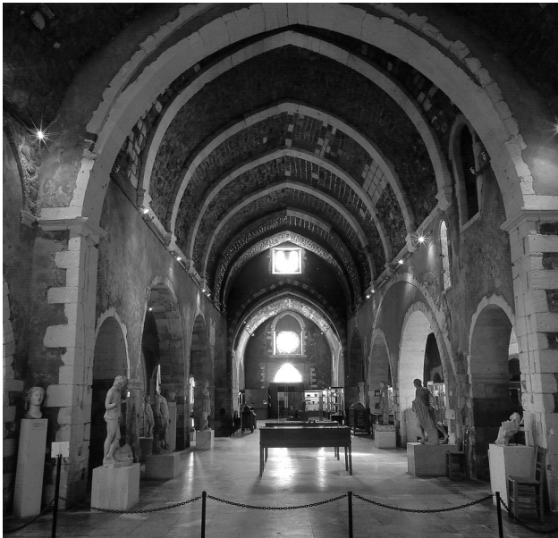
Fig. 9. Herakleion, Morosini Fountain, first half of the 17th century.