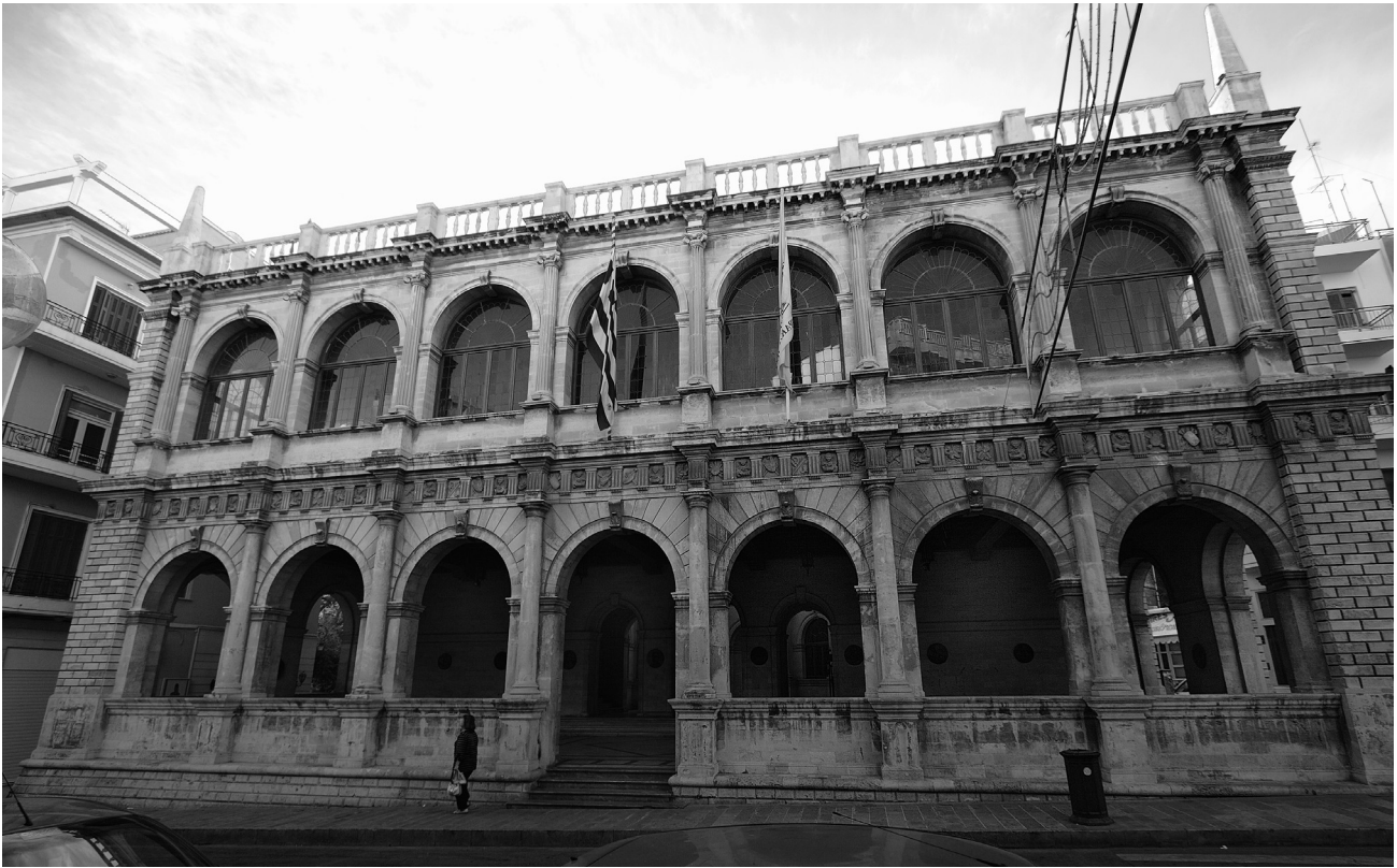
Fig. 7. Herakleion, Town Hall in place of the Venetian loggia. Rebuilt in the eighties.