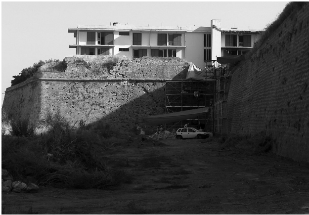
Fig. 11. Chania, Hotel Xenia on the seafront bastion of the Venetian wall. Before demolition, 2007.

as regards the protection and enhancement of a medieval monument. Nevertheless the restoration was done without any prior study or documenting of the extensive building history of the complex, with unauthorized use of concrete and the creation of an entirely new pseudo-Romanesque doorway at the east end, where the presbytery had once stood, as there was no access on the other sides of the building which belonged to various owners.