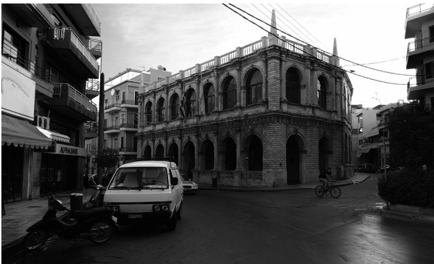
Fig. 8. Herakleion, as fig. 7, view from southwest.

town without pavements. Ugly residential blocks, all built since 1960, now crowd around it (fig. 8).