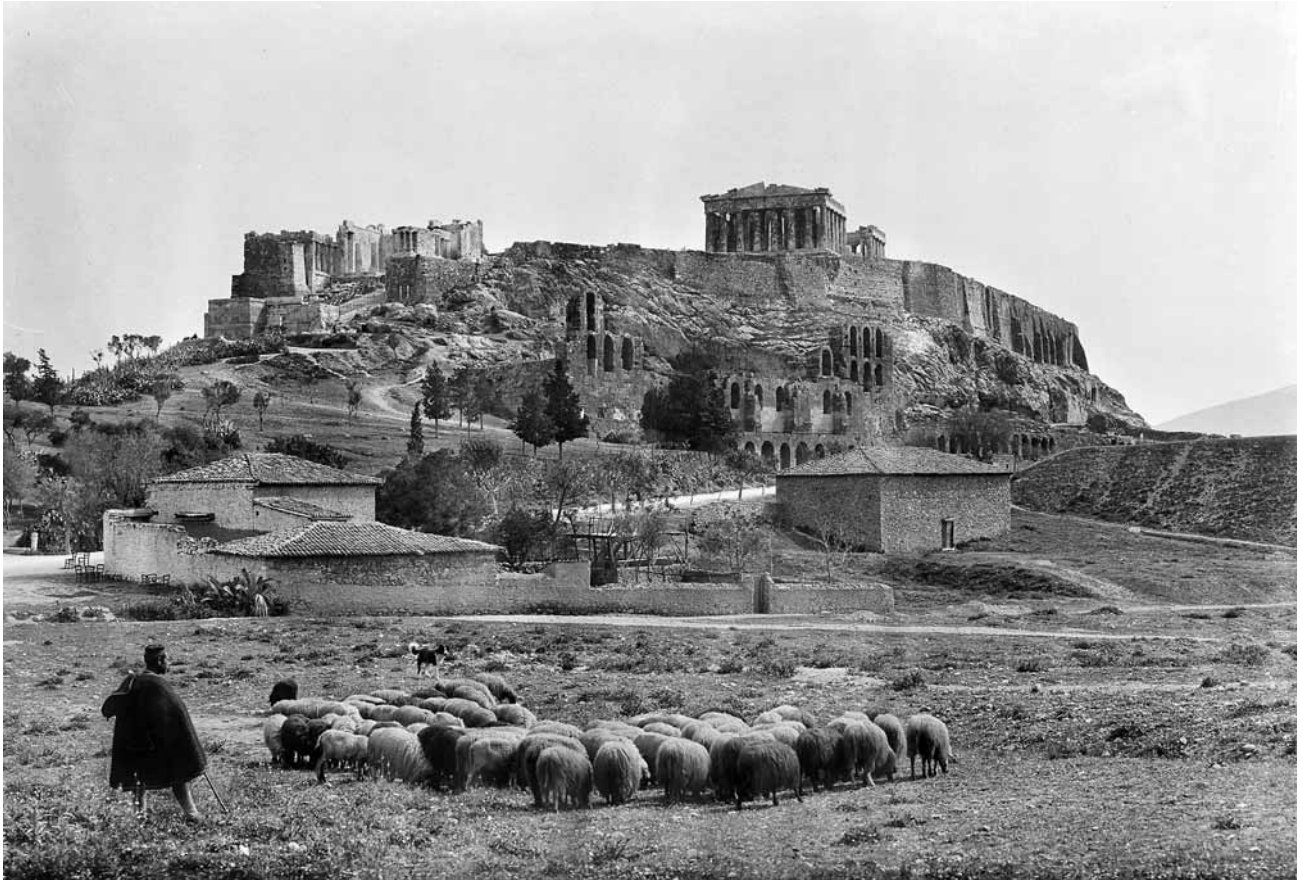
Fig. 3. F. Boissonas, The Acropolis from the southwest , 1903(?).

more serious work, inside Greece as well as outside. Athens, writes Willoughby, 'still lives, still draws to herself the souls of those who do not see the modern travesty that bears her name' – a sentiment that, in its anti-urbanism, its refusal to acknowledge present changes and present challenges encapsulates the spirit of the new Neoclassical outlook. 16