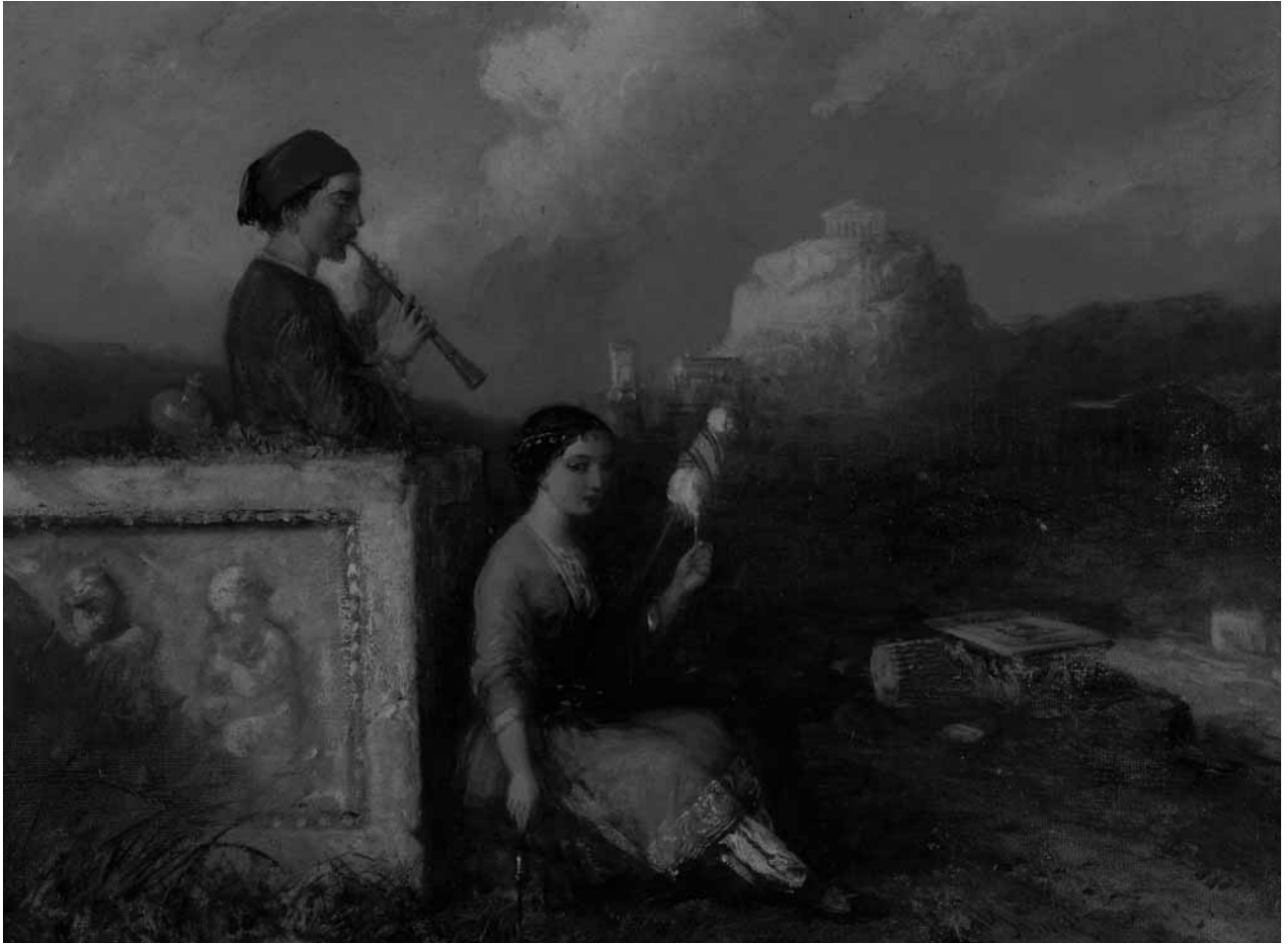
Fig. 1. J. Linton, A Greek Couple (ca. 1860). Athens, Benaki Museum inv. no. 9006.

view of the entrance to the Acropolis in du Moncel's Vues pittoresques des monuments d'Athènes (fig. 2): 14 the setting sun casts a long shadow over the foreground, in which a few stray onlookers stand amid the boulders and debris of the still unrestored pathway up. Above them looms the dark mass of the Frankish tower, not yet demolished; its tip, like the columns of the Propylaea itself and the Temple of Athena Nike to the side, is jagged and incomplete. Like Baalbek for Volney – the locus classicus of this trope – the half-eroded columns of the classical past merely point up the woeful inadequacy of the present.